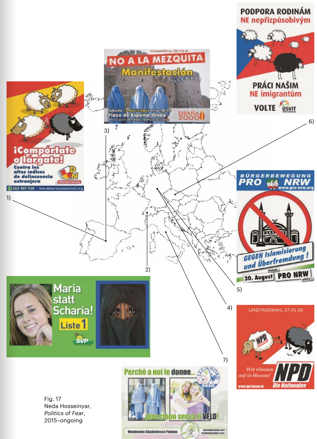
Fig. 17 Neda Hosseinyar, Politics of Fear , 2015–ongoing

Politics of Fear is part of an ongoing research project dealing with the topic of cultural racism. The project focuses on this interaction of elements such as culture, religion, ethnicity, gender, and identity in Islamophobic discourse.