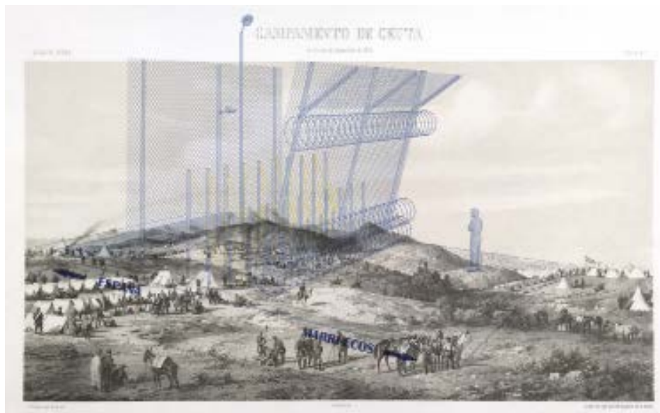
Fig. 16 C.A.S.I.T.A., Fences at the Border in Ceuta and Melilla 1985–2014 (Infographics) , 2014

The fences at Ceuta and Melilla are architectural models of neoliberal exclusion, control and surveillance. As spatial and functional models, they are test prototypes on the processes of segregation of certain bodies, subjects. They can then be replicated in other spaces and in other contexts, with other scales and functions, such as airports, customs, border