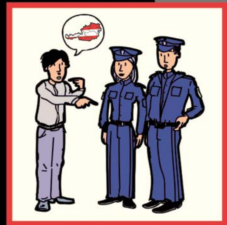
Fig. 12 Marika Schmiedt, Human Dignity Is Violable: No Fundamental Right to a Better Life! , 2016. The poster reads: "Truth, Freedom, Patriotism. Modern migration is a hostile conquest!"

Diese moderne Völkerwanderung ist eine feindliche Landnahme!