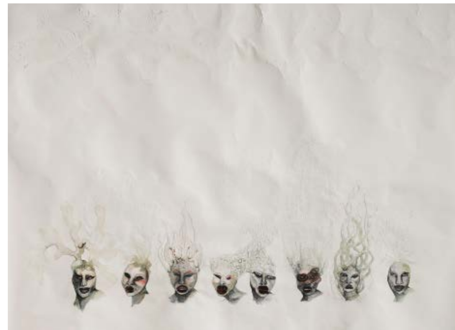
Fig. 15 Ellen Gallagher, Watery Ecstatic , 2007