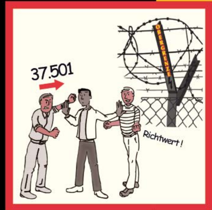
Fig. 14 Marika Schmiedt, Human Dignity Is Violable: No Fundamental Right to a Better Life! , 2016. The poster reads: "Situation FLEXIBLE. 37,500. Approximate value!"