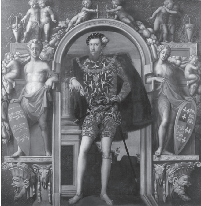
Fig. 2. Henry Howard, Earl of Surrey, NPG 5291.

succession, despite its obvious reverence for the Howard past. In boasting a “genealogy worthy [of] a possible king,” the painting argues that its subject “possessed a right to be Protector to the young Prince Edward”—and the canceled image of Richmond, Edward’s half-brother, would have powerfully reminded that Surrey had already once nursed the blossoming of a Tudor royal son. 126 At the time of Surrey’s trial, we will see below, similar images of genealogical interest were seized from the Howard residence at Kenninghall—where they served, we must presume, not as external envoy of Surrey’s credentials, but rather as an identity-affirming mirror of their subject, mired in the most difficult (and final) year of his young life. The form of that identity, emerging from the insistent, inextricable proximity of Surrey’s Howard blood to the Tudor throne, replicates much of the symbolic dynamics embedded in “So crewell prison.”