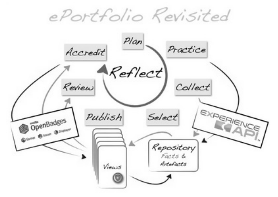
Figure 1. ePortfolio revisited

Thanks to the portable and interconnected nature of open badges, it becomes possible to map the skills of a person, of an organisation, of a territory, easily in real-time. The construction of a network of accredited and complex badges renders the recognition of informal learning just as valid and worthy of trust as the traditional accreditation of a formal setting training.