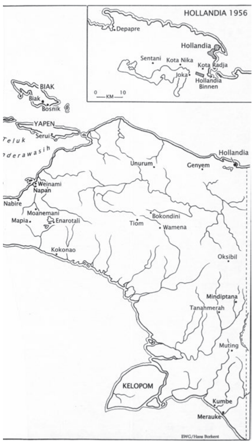
New Guinea, main administrative places 1950s-1960s