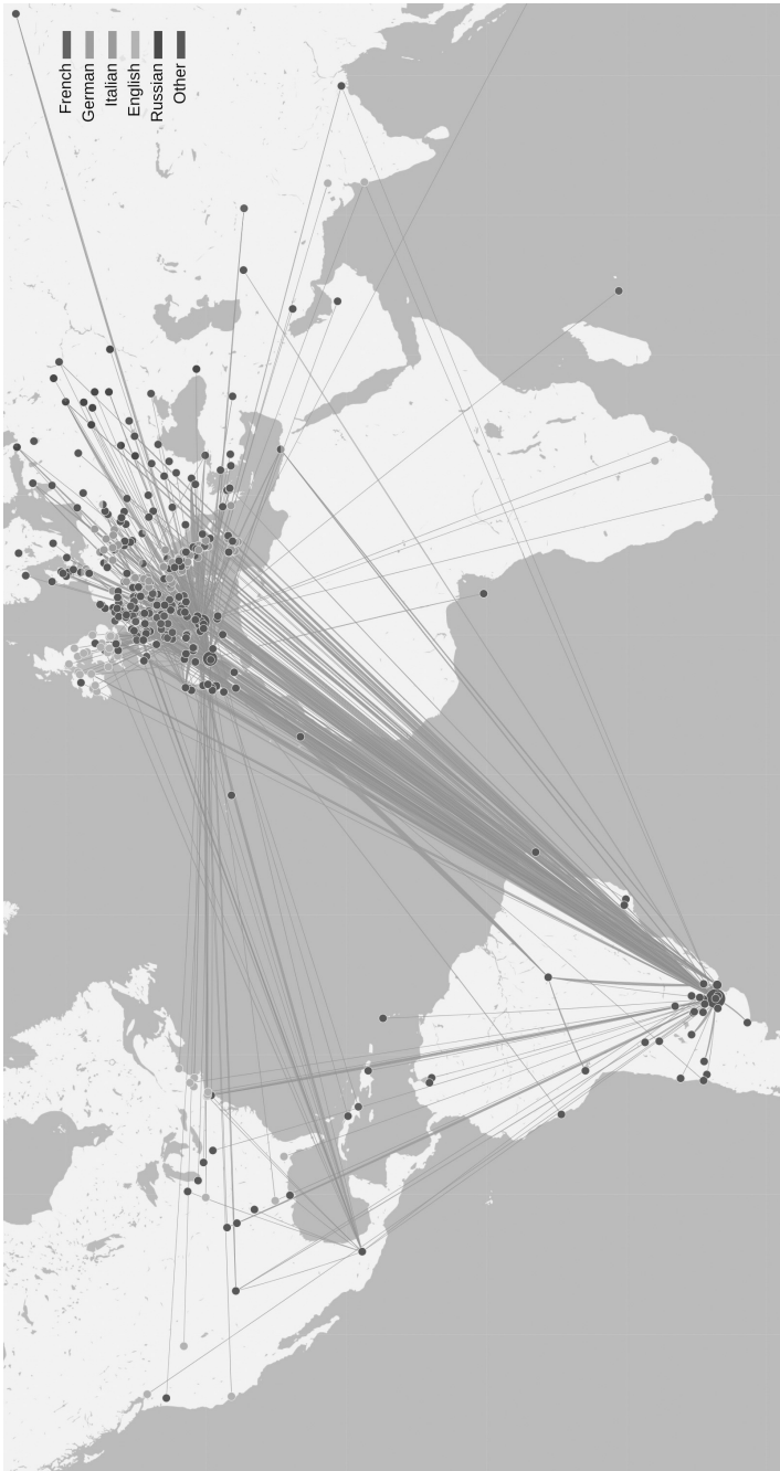
Figure 13.2 Map of the origin of translated authors, their original languages, and the places of publication of their translations