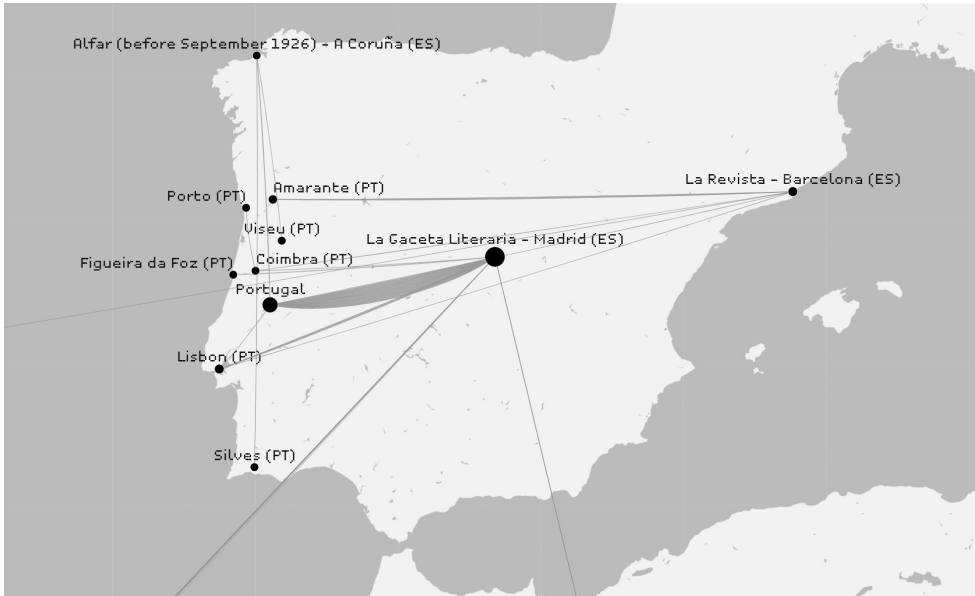
Figure 13.6 Place of publication and origin of Portuguese-speaking writers in La Revista , La Gaceta Literaria , and Alfar (La Coruña)

As stated above, this chapter raises methodological issues for transcending linguistic frontiers – and also looks at a broad geography of literary translations in periodical publications, combining experience with large- and small-scale analysis. It draws attention to the activities of lesser-known periodical publications and mediators (translators, but also critics, editors etc.). It has also aimed to gather qualitative results through the use of various quantitative models, treating metadata as a relevant and unexplored source of information. Finally, this chapter has sought to highlight the benefits of combining inputs from the sociology of translation, cultural mediation and social network analysis, and the digital humanities. In the near future we hope to add discourse analysis and topic modelling by taking on close and distant readings as well. Evidently, there is still much work to be done in this thriving field of research; for example, a gender perspective for literary translation in periodicals is still needed, as is an examination of the different ways of measuring the real or relative impacts or ‘successes’ of a given publication.