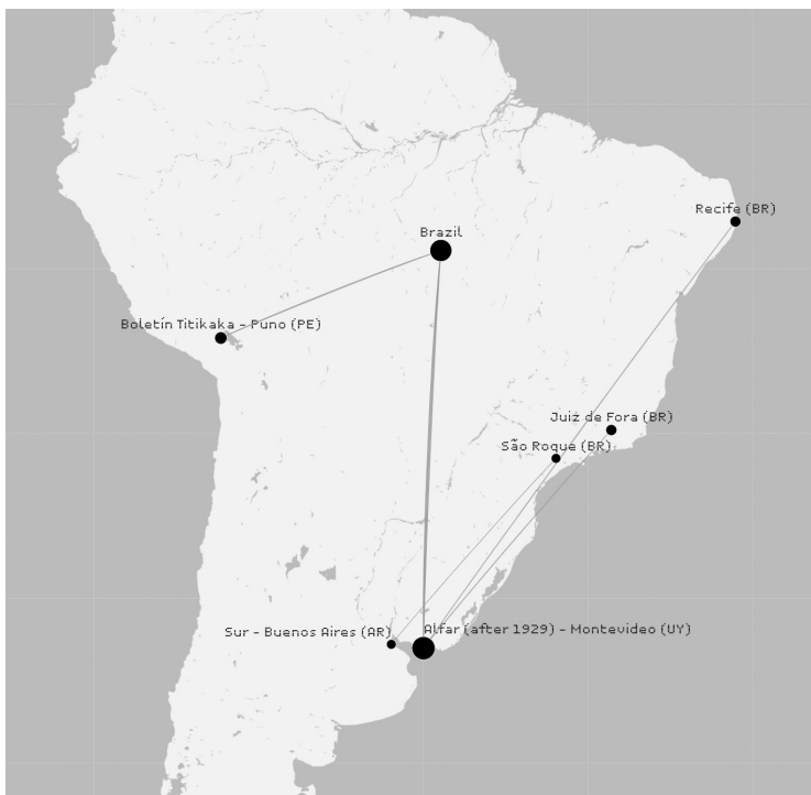
Figure 13.5 Place of publication and origin of Portuguese-speaking authors in Sur , Alfar , and Boletín Titikaka

we may find translations of Brazilian writers, while in La Revista and in a publication from Alfar 's early stages we only find writers from Portugal. La Revista translated all texts to Catalan and never included texts in the original language.