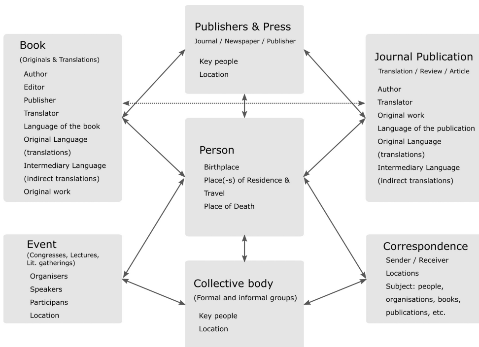
Figure 13.1 Schematic representation of the main types of objects and the relations between them.

similar tasks would be of enormous interest as a way of advancing research of this kind. Our project has established a collaboration agreement with the University of Tübingen, in Germany, specifically with the group led by Hanno Ehrlicher, who directs the above-mentioned project Revistas Culturales 2.0 . (Cultural Magazines 2.0), allowing us to enrich our database with several of the mentioned magazines and identify dispersed translations in the Ibero-American cultural press. The following visualizations 4 illustrate certain aspects of interest, such as the diversity of translated authors in the selected corpus. Using our geographic visualization (Figure 13.2), we may gauge the global scope of the origins of translated authors published in the magazines we are currently working with (four Argentine magazines, Proa , Martín Fierro , Nosotros and Sur ; the Mexican magazine Contemporáneos ; Boletín Titikaka from Perú; the Madrid-based La Gaceta Literaria and the Catalan La Revista ).