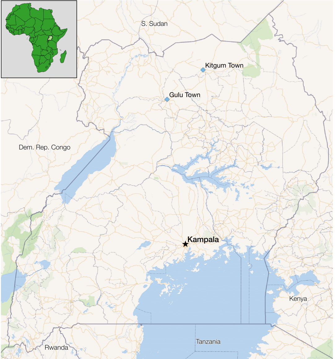
MAP 1. Map of Uganda.