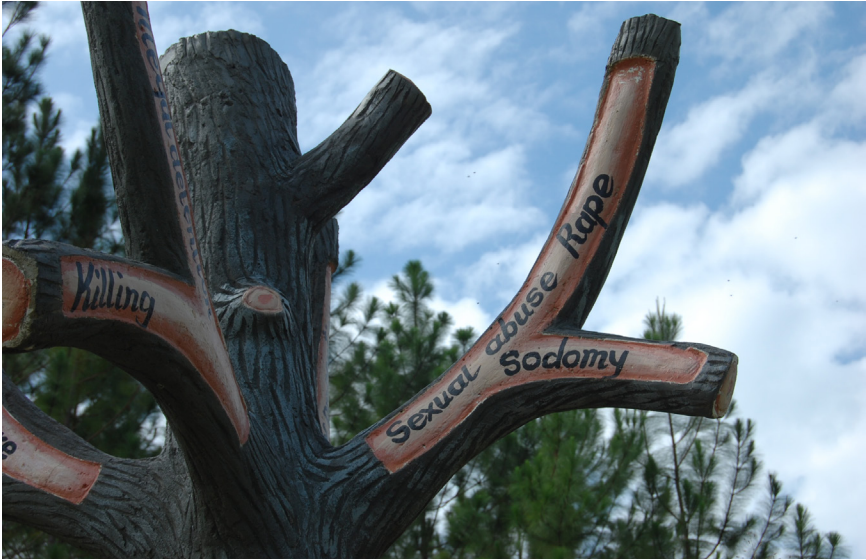
FIGURE 3. Monument in Burcoro, Awach subcounty.

executed by a firing squad—and is located at the former execution spot. A variety of human rights abuses and crimes perpetrated during the massacre, such as killings and acts of torture, are marked on the different branches of the tree. One of the branches, clearly visible to everyone who inspects the monument from the front, reminds the viewer of crimes of “sexual abuse,” “rape,” as well as “sodomy,” which is how male rape is often referred to in English across the region.