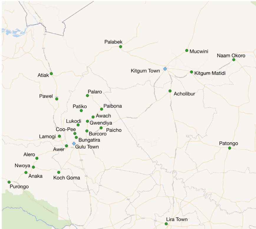
MAP 2. Map of Acholiland documenting cases of tek-gungu.

absence of reliable quantifiable data, the map does not indicate prevalence within respective localities but instead illustrates the variety of locations in which NRA soldiers reportedly raped men.