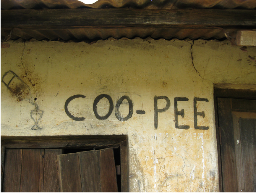
FIGURE 2. Coo-Pee.

absent from Coo-Pee. Other men remained in the village but were considered spiritually, symbolically, and psychologically not to be there. Confronted with the hardships of conflict and contextualized in a continuum of severe discrepancies between socially constructed and homogenized expectations and heterogeneous phenomenological lived realities, some of these men did not perform in their socially conditioned masculine roles and were thus displaced from their gender identities. At the same time, various other men were considered not to be there because they were “turned into women” as a result of having been raped by government soldiers, which was thought to have heavily impacted their masculinities and to displace them from their gendered personhood.