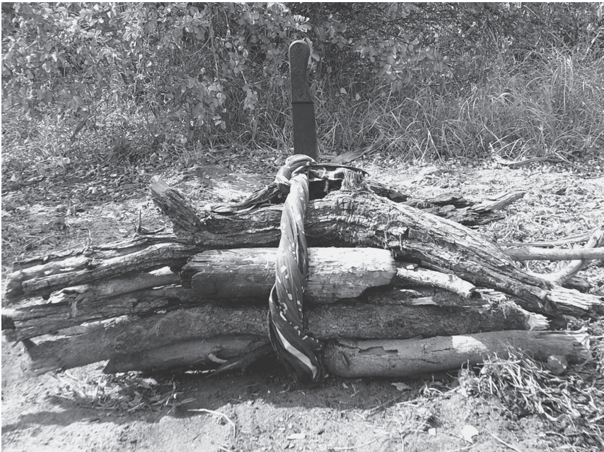
FIGURE 0.4. A pile of fuelwood. Photo and narrative by Neema, a female farmer, August 2016.

I worry about getting caught by the mgambo every time I go collect fuelwood. I pray to God often. People are finding it hard to move forward with their lives. It feels like we are being squeezed, like we've been put in between brackets. It's like we've been informed of an impending death of a relative. Life goes on, but it's difficult not knowing when or where I will be moved to. . . . Men can always go off somewhere and do casual work. It's harder for women, older people, and especially widows like me. And much harder for elderly women who are disabled, like my mother. 17