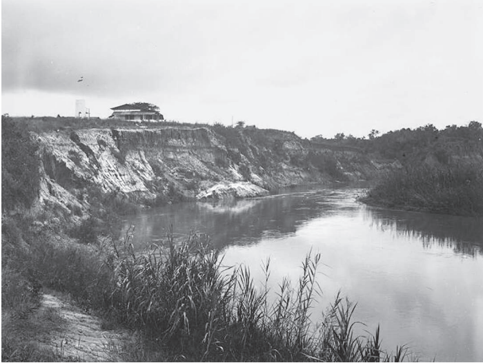
FIGURE 2.13. “The Wami River at Kissanke [sic],” German East Africa, c. 1906–1914. Though the larger building atop the bluff no longer exists, the water tank still remains in the landscape.