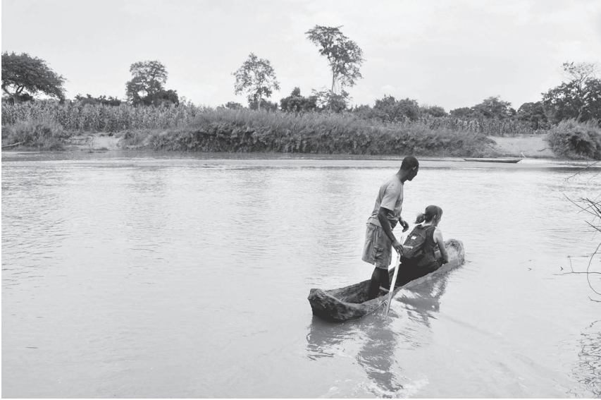
FIGURE 0.6. Crossing the Wami River by dugout canoe ( mtumbwi ).

(14 percent female, 86 percent male) in Dar es Salaam and Bagamoyo town. These interlocutors included government officials at the village, ward, district, and national levels; donor agency representatives; corporate executives and employees; and Tanzanian academics, activists, and lawyers with interests in gender, land, development, and agrarian change. The vast majority of these informants were men, highlighting the structural gender inequalities and inequities that shape political participation and decision making.