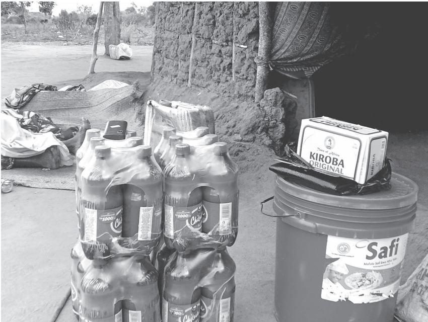
FIGURE 5.2. Alcoholic beverages for sale at Neema's, including Chibuku, Kiroba, and home-brewed honey beer inside the plastic bucket. Photo by Neema, August 2016.

I have been having fewer and fewer customers since 2011. And in 2014, the mgambo put up a gate [about one hundred meters from her house].