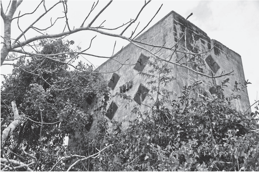
FIGURE 2.1. Remains of a colonial-era plantation in Kisauke on the north side of the Wami River. Photo by the author, August 2014.

the soil; the land morphs into water at certain times of the year to bring bountiful harvests and catches of fish; the land offers spaces of sociality and seclusion during female initiation rites; and the land holds gendered wisdom on how to live and work with nature. Simultaneously, however, the land obscures a morass of ambiguous boundaries, conflicting maps, and overlapping property rights; it conceals the traumas and triumphs villagers faced, and continue to face, as they wrestle with the legacies of old and new enclosures.