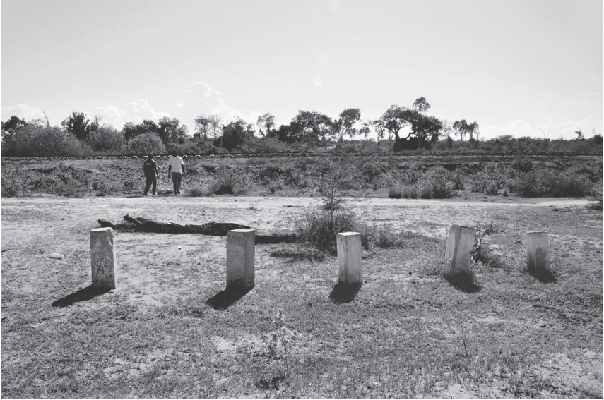
FIGURE 0.2. Concrete posts on the western border of the EcoEnergy project area were installed in 2014 as part of the project’s early works. Photo by the author, March 2016.

socialism in the wake of decolonization. 4 Reaffirming the ambassador’s words and preempting potential critics among the crowd, the minister for agriculture stated in his remarks: “There is an issue that has been debated everywhere globally, and that is land grabbing. . . . There is no land grabbing in Tanzania. . . . Investors do not come here to replace smallholder farmers.” Instead, the EcoEnergy project, the minister said, would mark an important milestone in President Jakaya Kikwete’s ongoing effort to bring agricultural modernization and rural development into a “win-win” partnership with foreign investors. 5