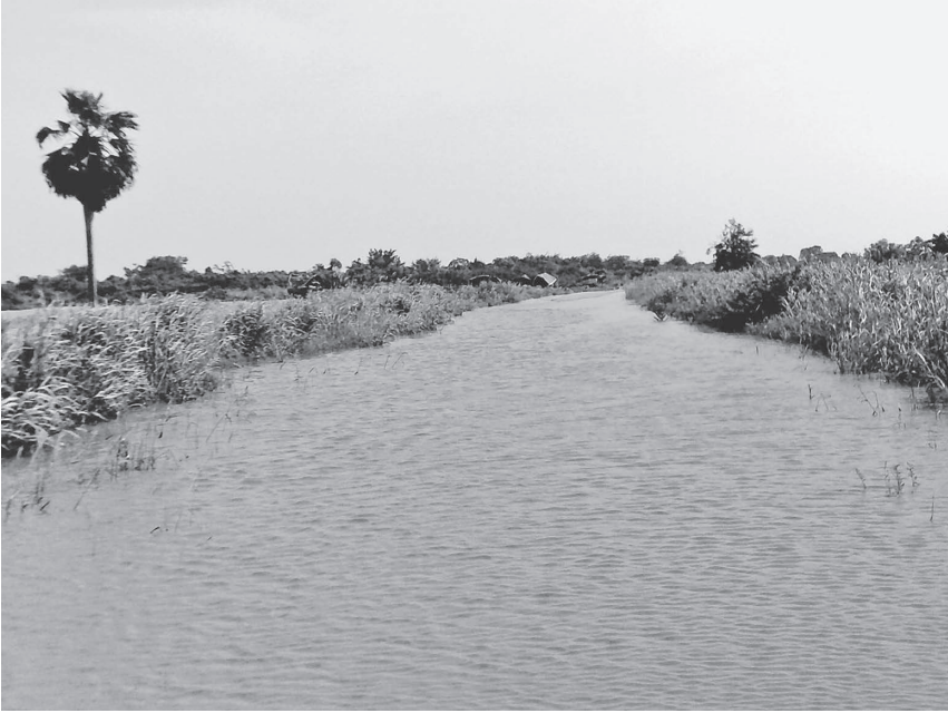
FIGURE 6.3. Gama during the long rainy season, showing inundated floodplains.