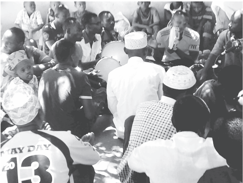
FIGURE 2.10. Maulidi (Islamic religious celebration). Photo by Mwanahamisi, December 2015.