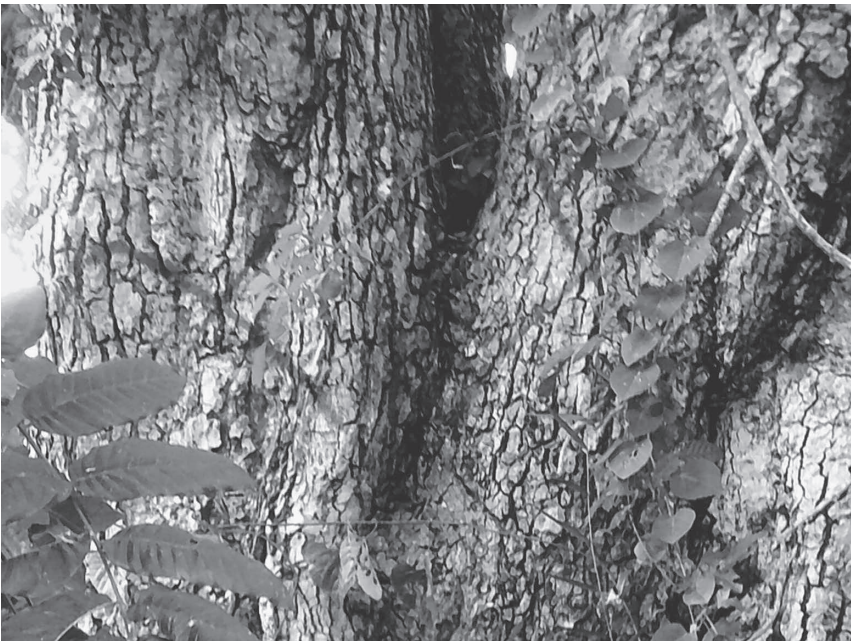
FIGURE 0.5. A tree marked for removal by two red X's. Photo and narrative by Nuru, a female farmer, September 2016.

I use liminality as a guiding heuristic to organize my analysis and to refer to the socially constructed condition and experience of in-betweenness, specifically as it relates to the unpredictable spacetime between land acquisition and capital accumulation. As a lived and felt phenomenon, liminality indexes what cultural critic Raymond Williams called “structures of feeling,” or the “complexities, experienced tensions, shifts, uncertainties, the intricate forms of unevenness and confusion” that are inherent to the process of change but that social analysis often misses or brackets as noise. 19 Liminality, as I go on to show, is not an accidental or static condition where everything is temporarily “on pause.” Rather, it is a dynamic and contingent spatiotemporal relationship that state, corporate, and various nonstate actors with divergent and incommensurable interests, values,