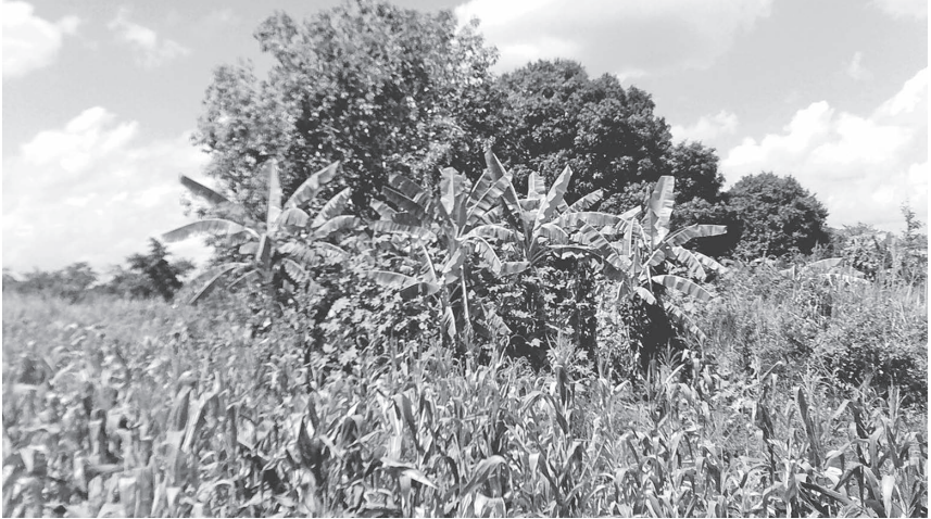
FIGURE 2.5. Halima's farm in Matipwili in kitopeni (muddy area/season). Maize is intercropped with banana, mango, and wild plum trees. Photo by Halima, September 2016.