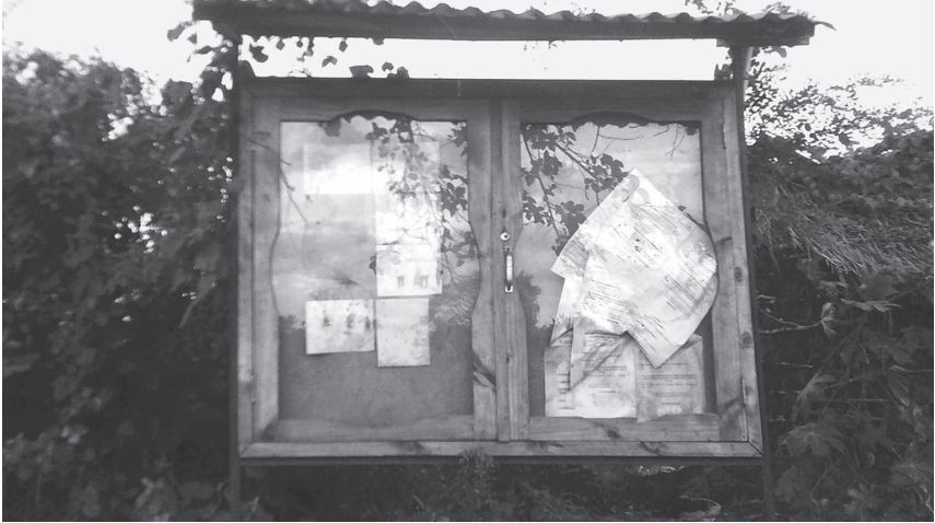
FIGURE 4.1. A neglected notice board displaying information about the Early Measures. Photo by Halima, July 2016.

unilaterally terminated her contract around mid-2015, which resulted in an immediate and indefinite suspension of the Early Measures. She said that EcoEnergy had failed to pay her invoices for nearly six months before the termination of the contract, during which time she had to meet all program expenses out of her pocket, including her employees' wages. 26 Once Anna and her team withdrew from all ongoing activities, the only remaining actors that represented EcoEnergy on the ground were the civilian paramilitary forces, the Jeshi la Mgambo (People's militia), commonly referred to as mgambo . Their presence was not new; EcoEnergy had deployed them in 2014 when the company temporarily began a series of early works, namely the installation of cement posts around the project site boundaries to close off roads and entryways and to prevent unauthorized movements of people and goods (see introduction).