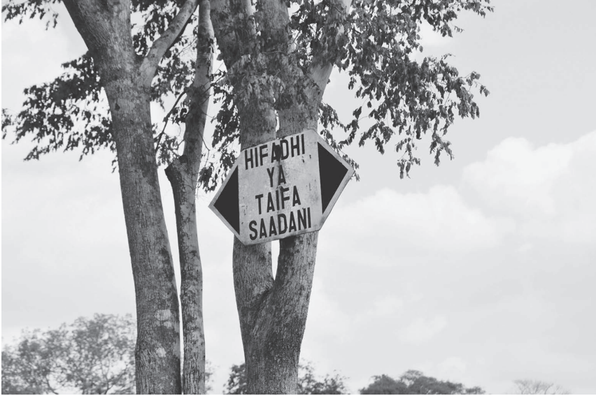
FIGURE 2.17. A sign for Saadani National Park is affixed to a tree in Matipwili. Photo by Mwajuma, March 2016.

way to Gama. As Mwajuma, a female elder introduced earlier in the chapter, complained, “TANAPA has a habit of eating [ kula ] people’s land and shifting their boundaries. They use different stones to mark their borders. Other times they just put up a sign on a tree [figure 2.17] and say, ‘This is national park land,’ when in fact we are the ones who have been using the land for generations!” 112