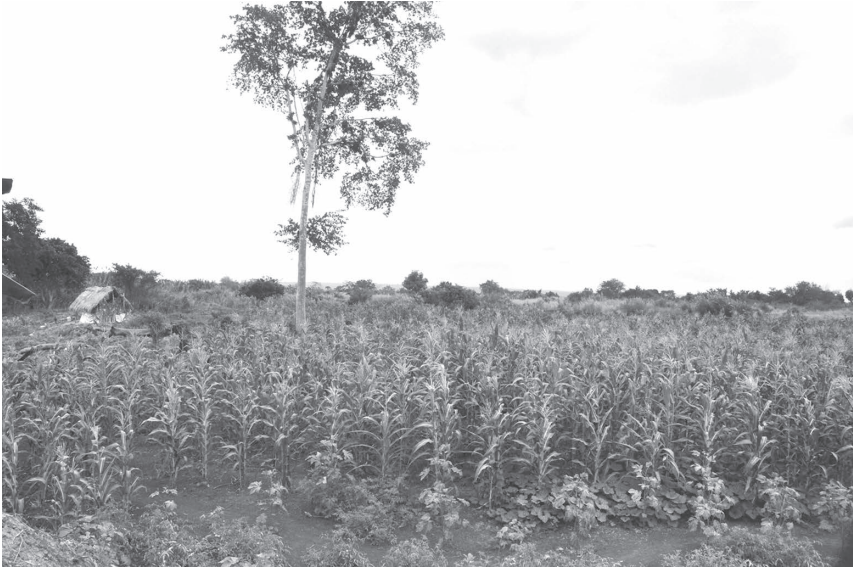
FIGURE 2.8. Mwajuma’s farm in kitopeni. Maize is intercropped with okra and pumpkin. Photo by Mwajuma, August 2016.

shaped people’s livelihoods, identities, and cultural traditions as “coastal people” or “the people of the valley.” And as the discussion below will further illuminate, these material and symbolic relationships carried important gendered meanings.