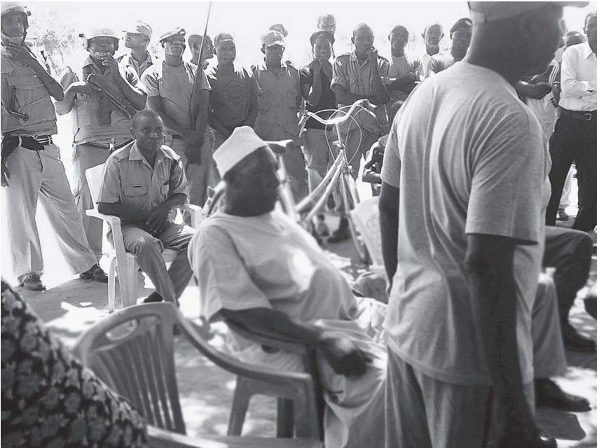
FIGURE 4.3. Public meeting with the mgambo (civilian paramilitary forces), the district police commissioner, and residents of Makaani, No. 4, and No. 5. Photo by Selemani, December 2015.

Another reason for the disproportionate harm against men was that many women and children had left the area since violence escalated. Many feared that the land was becoming “no place for a woman,” and the left-behind husbands and fathers suggested that they would invite their families back only if the land became habitable again. 43 The exodus of women and children was especially evident in the settlements in the northwestern part of the project site, where the largest number of migrant populations resided and where the mgambo maintained the heaviest presence. In a photo-narrative, a young male farmer describes one particularly intense confrontation the residents of this area had with the mgambo and the district police commissioner in December 2015 (figure 4.3): “The mgambo have been intimidating the villagers. They have taken away people’s farm tools, women’s cooking utensils, radios, bicycles, etc. . . . One day a young man in No. 5 was beaten for making charcoal; people couldn’t take it anymore, so they rioted. And then the mgambo threatened to shoot the villagers. That’s why the district police commissioner had to come and intervene.” 44