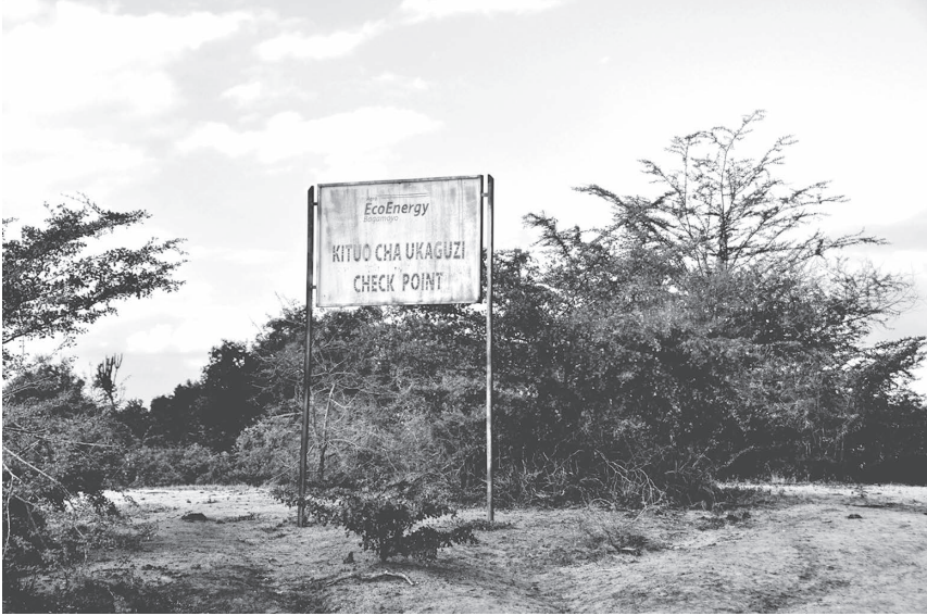
FIGURE 4.2. Kituo cha ukaguzi (inspection checkpoint) near the northwestern border of the project site. Photo by the author, June 2016.

reproduction and masculine identity for poor young men, a pattern observed not only in Bagamoyo but elsewhere in Tanzania and across urban and rural Africa. 36 Individuals like him who volunteer to join the mgambo today are still trained by the military and armed with weapons, but the principal motivations behind their enrollment have arguably less to do with their allegiance to the ruling party, its political ideology, or patriotic nationalism than their need for money and daily survival. When I asked the new recruit how he would describe the mgambo 's relationship with EcoEnergy, he stated that he had not been aware of the company or the land deal until he arrived on-site. Nevertheless, he sounded confident in describing the duties that were assigned to him: "Our job is to protect the project area. The people here are intruders. I am told to make sure that they are not cutting trees for fuelwood and charcoal. When we find them doing these things, we turn them in to the police, so they can be prosecuted." 37