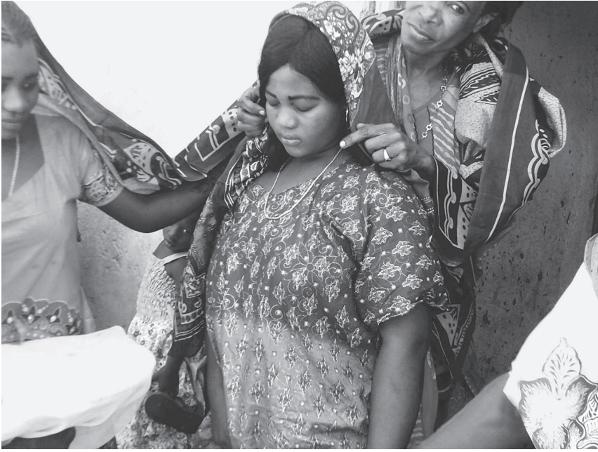
FIGURE 2.11. Unveiling of the mwali. Photo by Mwanahamisi, December 2015.

This private ritual is followed by an ngoma , a public celebration involving drum and dance that is open to everyone in the community. It is often accompanied by maulidi , an Islamic religious celebration involving tambourine music and the recitation of devotional poetry and verses from the Koran. 36 Afterward, the mwali is escorted outside the house of seclusion under the protection of a kanga (colorful cotton wax print fabric) held high up by her older sisters and female adult cousins. The passing of the threshold, the particulars of her hairstyle and dress, and her subsequent unveiling by the kungwi constitute a symbolic announcement of her entrance into womanhood.