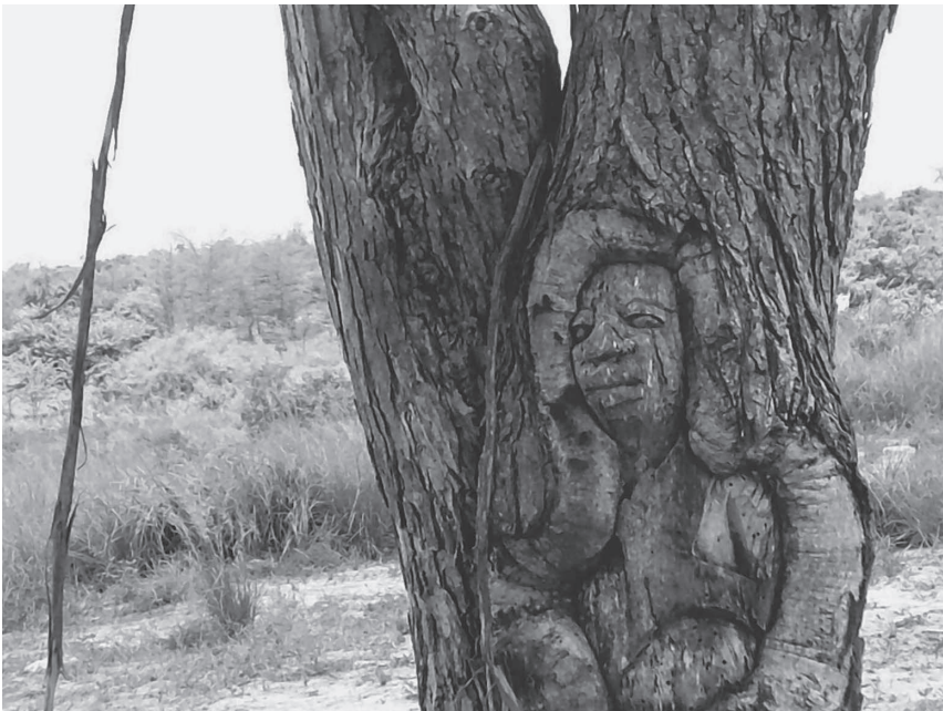
FIGURE 0.3. A tree carving.

When the project people came and asked if this land was mine, I said of course, look at this tree! When my neighbors see this tree, they know that they are on my land. But the project is giving us a lot of worries. Investment isn't bad, as it will benefit the nation. But the way they are doing things, it makes me feel terrible. For so many years, we have been told not to grow things with roots, not to build houses, not to expand our farms. This is no way to live. The land is ours, but we are living here like refugees. 16