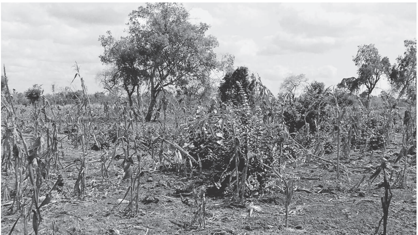
FIGURE 2.6. Neema's farm in Razaba during kiangazi (dry season). Dried maize stalks are waiting to be cleared for the next planting season. Photo by Neema, September 2016.