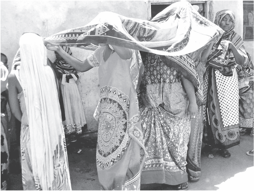
FIGURE 2.9. Mkole (female initiation ceremony). The initiand's ( mwali ) physical crossing of the threshold of a door, her dress and hairstyle, and her subsequent unveiling symbolize her entrance into womanhood. December 2015.