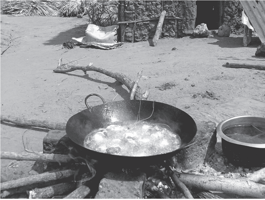
FIGURE 5.3. Fried prawns and catfish for sale. Photo by Neema, August 2016.

There was a lot more foot traffic here in the past, and many workers in the area were my customers. The mgambo put up the gate to stop new people from coming in and to restrict the charcoal trade. The charcoal makers went somewhere else, so I lost my customers. 51