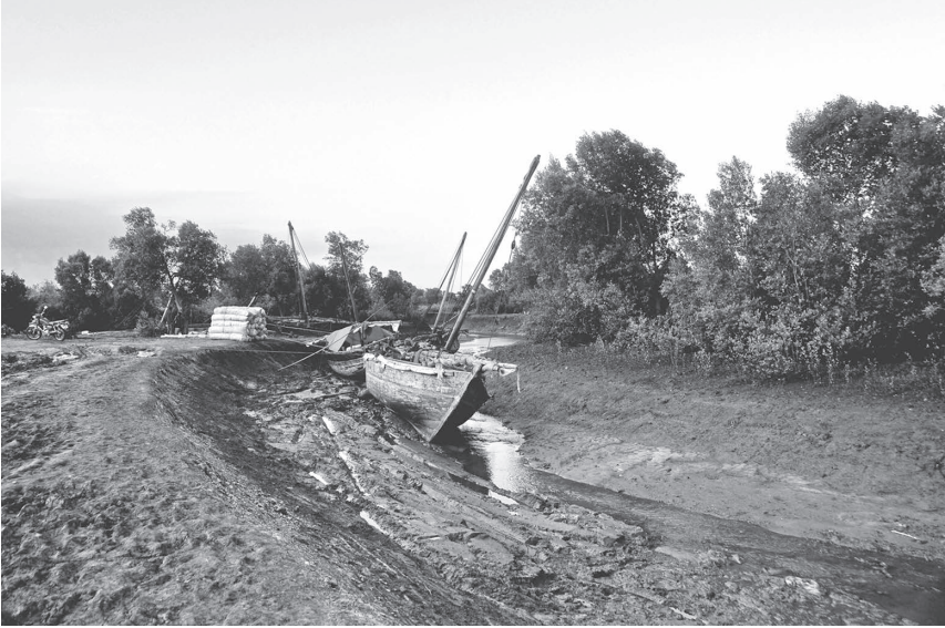
FIGURE 5.1. Boats lie at anchor at bandari bubu (an illegal port) in a tidal channel near Winde. Charcoal bags are stacked on the bank. Photo by the author, September 2016.