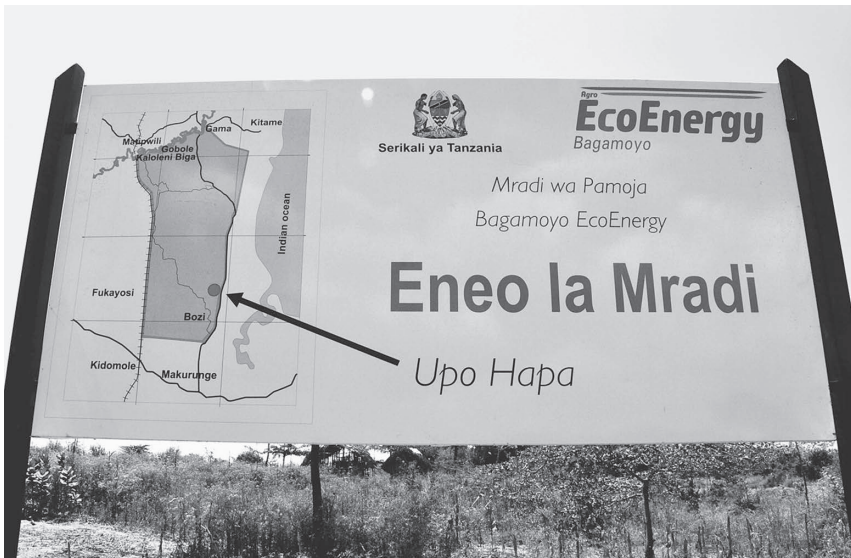
FIGURE 0.1. A sign shows a map of the project area and states in Swahili that the project is a partnership between the Tanzanian government and EcoEnergy. Photo by the author, August 2014.

In his remarks, the Swedish ambassador to Tanzania emphasized how the project would “break new grounds” in the fifty years of “friendship” between the two nations—a relationship originally built on their ideological affinity to