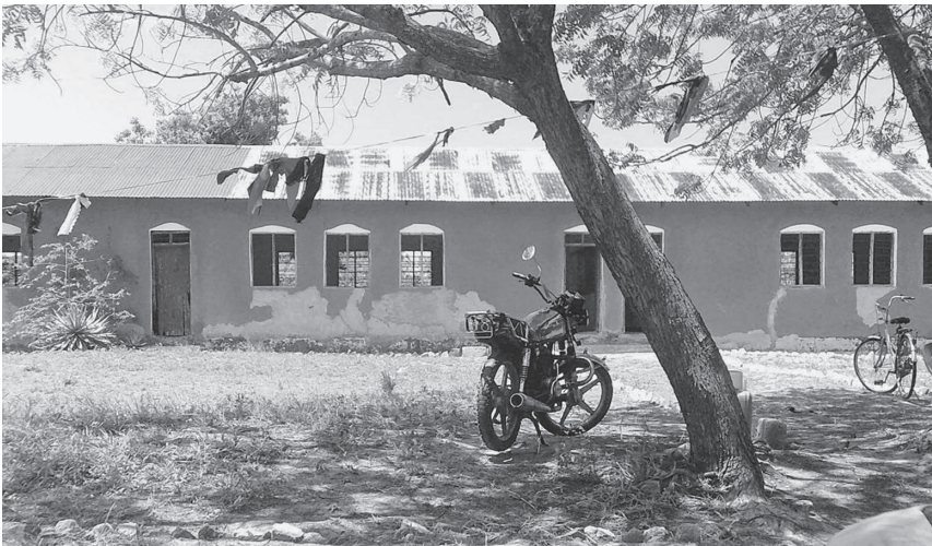
FIGURE 2.15. Razaba primary school, established in 1989. The school was forced to close in 2014 as many teachers left as a result of the uncertainties surrounding the EcoEnergy project. Photo by Zainab, December 2015.

By the early 1990s, however, the ranch was struggling to stay afloat. As the former ranch workers recounted, the last of the livestock were shipped off to Zanzibar in 1993, and all workers were dismissed by 1994; all other ranch assets were sold, and the dispensary, too, was closed by the end of 1995. Various theories exist about why the ranch closed, including insufficient veterinary services and a tsetse fly infestation. But according to the ranch manager, the fundamental