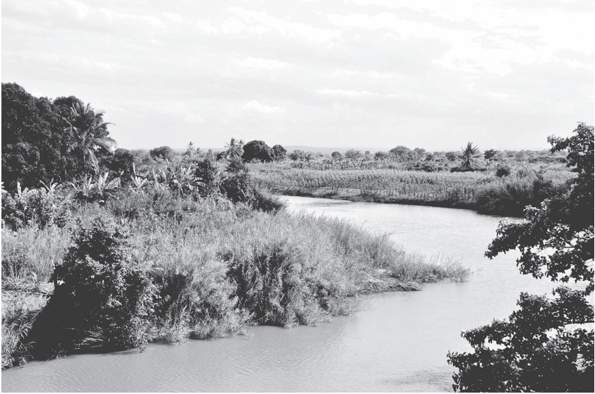
FIGURE 2.4. The Wami River and the agricultural landscape in Matipwili. Photo by the author, August 2014.

it was known during the colonial period, although the boundaries among coastal ethnic groups, including the Doe, Zigua, Kwere, Zaramo, Luguru, Kutu, and even the Nyamwezi in precolonial times, were fluid, and their socioeconomic relations closely intertwined. 14 According to oral histories, the Doe also intermarried with the Makua, another coastal ethnic group from southern Tanzania (Mtwara region) and northern Mozambique. It is said that three Makua men, Funditambuu, Kimalaunga, and Chamsulaka, arrived in Bagamoyo during the reign of the first sultan of Zanzibar, Majid bin Said (1856–1870), to hunt elephants and participate in the growing ivory trade. 15 Funditambuu was an exceptionally skilled hunter and is said to have taught the local Doe and Zigua men how to hunt. Of the three Makua men, only Funditambuu had come with his wife; but because she was barren, he married a daughter of a local Doe chief. The couple gave birth to a son, to whom many farmers in Wami traced their ancestry. The early Makua hunters initially occupied the area of Makaani (a name derived from kaaeni , meaning “stay”), but their descendants settled closer to the river, an area better suited for agriculture and fishing. 16