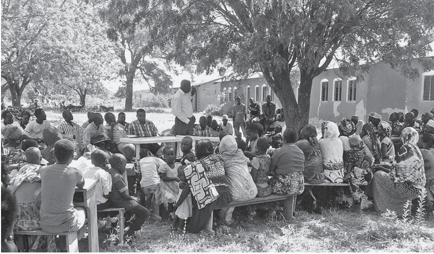
FIGURE 2.16. Despite the Razaba primary school's closure, its grounds still serve as a meeting place for the villagers. Photo by Zainab, December 2015.

reason was the government's increasing indebtedness and the demands of structural adjustment. "A lot of state ranches and farms were closing at the time," he said. "The ranch faced economic difficulties, and the government didn't have enough money to run the ranch." 85 Unlike other state-owned farms at the time, RAZABA was never privatized. Seeing that the land was going to remain unused, the laid-off workers requested permission to remain there. The manager agreed, but under the condition that they continue cultivating only short-term crops and that they be ready to vacate the land when required. As he explained, "There was nothing written about the arrangement, just a verbal agreement. We told them to stay there as a means of earning their lives; they can cultivate annual crops like maize or something like that while they waited for other development to come. They knew they would be chased out someday." 86