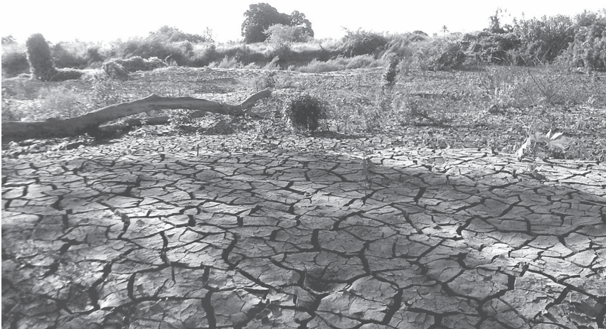
FIGURE 2.7. Mwajuma's farm in Matipwili after the recession of the annual flood. Photo by Mwajuma, April 2016.

As Halima, Mwajuma, and many others in Wami have highlighted, land and water were not isolated biophysical elements of the landscape, nor did they consider weeds and floods as disturbances, contrary to how EcoEnergy project documents described them. 28 Land, water, weeds, and floods were not only critical to the ecological functioning of the river and the riverine landscape, but they also