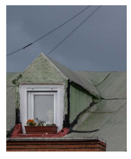
Figure 5.4: 'Woman at Window' by Inés Velasco

These works not only acknowledge that the confinement of the body can be imaginatively transcended in fantasy; they also subtly reinforce the necessity of that bodily confinement. I have written elsewhere that media reporting of cases of 'queue-jumping' at shops by people also prosecuted for criminal breaches of the COVID Regulations is indicative of the emergence of a strong normative code regarding movement in public places. In the pandemic, 'good' movements have come to mean movements that are patient, unhurried, in step with others. By contrast, movements that fall out of that common step betray a lack of decent self-restraint and forbearance. The latter may not necessarily constitute a breach of the regulations on social distancing, but they certainly lend a justificatory rationale for