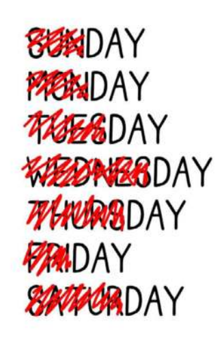
Figure 5.2: 'Daze of the Week' by Matthew Zaremba

These images speak to the theme of the normal course of things having been suspended or halted. The altered clocks and calendars suggest the temporal suspension of life, and the fused locks and ball-and-chain imagery explicitly reference imprisonment to suggest both personal and institutional pathways to justice blocked or stopped. For people actually 'doing time' in prison, of course, the sense of clocks having been stopped and locks permanently shut carries a particularly sharp meaning, cruelly suggestive of one's punishment being surreptitiously or capriciously extended – a figurative 'throwing away of the key to one's cell'. For those experiencing lockdown outside a prison environment, the images recognizably draw on a prisoner's frustration and helplessness at finding everyday, taken-forgranted possibilities regarding autonomous movement brought to a stop.