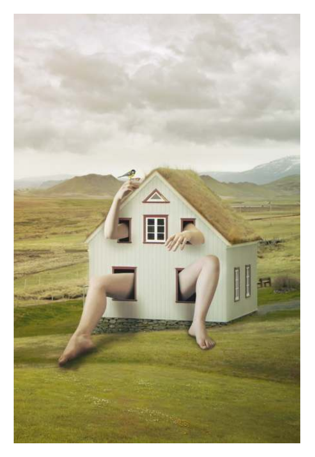
Figure 5.3: 'Confinement' by Orane Tasky

around its halls of residence in November 2020, with a single point of entry and exit to enable ID checks on students accessing or leaving their accommodation, students protesting held up signs including 'HMP University of Manchester', 'HMP Fallowfield' and 'students in cages' (Abbit 2020).