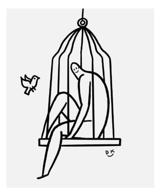
Figure 5.5: 'COVID Cage' by Denis Kakazu Kushiyama