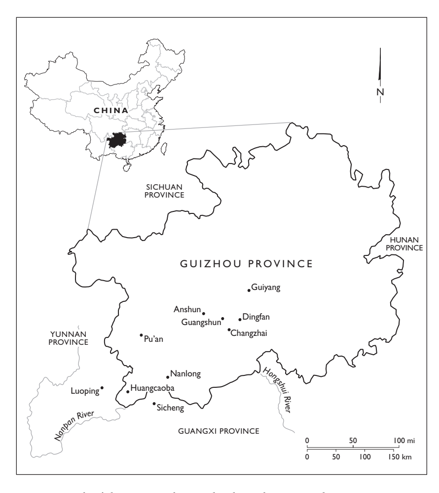
MAP 1. Guizhou's location in China and eighteenth-century administrative divisions within Guizhou