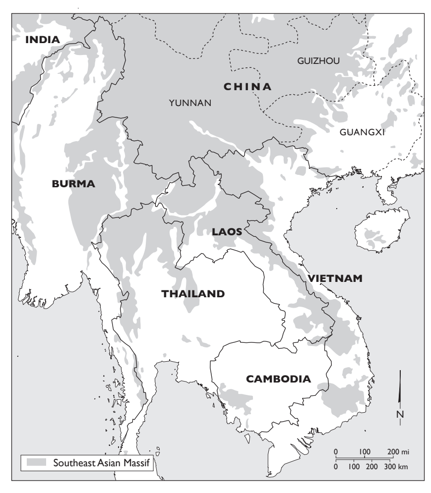
MAP 2. Guizhou's location in the Southeast Asian Massif