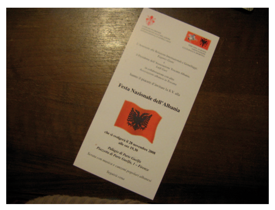
Fig. 2.2 Invitation of the Albanian community to participate in the Albanian national celebrations in Florence, November 2008. Note that the invitation is in Italian, as were the festivities themselves. The food served was a typical Tuscan menu

The first generation in Thessaloniki and Florence also shows receptiveness towards host cultures by integrating them into their family setting. This is seen in the cooking and arrangement of houses, though it is more in evidence among the highly skilled and those from urban areas in Albania. In rural-origin families, the internal arrangement of the dwelling reflects the model typical of Albanian post-communist houses, with the bufe (a cupboard with decorative cups, mugs, pictures of relatives and vases) in the central part of the room and prominent sofas against the walls (see also Dalakoglou 2010).