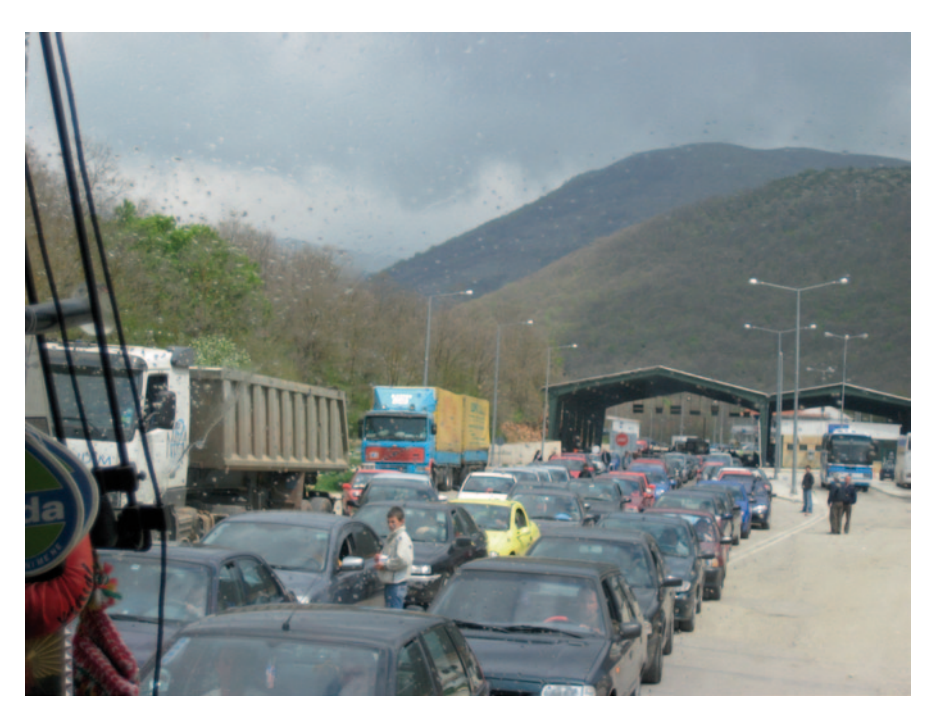
Fig. 4.1 'Keen transnationals': Albanian migrants in Greece returning to Albania for Easter 2008 through the Kapshticë -Xristalopigi border point

after regularization, and then ceased or were reduced because of clashes with kin or disappointments with the way migrants were treated in the home country. Or in some cases they increased because of (perceived) business opportunities in Albania.