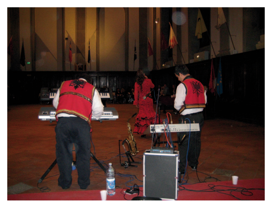
Fig. 3.1 Celebration of the Flag Day by the Albanians in Florence, November 2008

to celebrate Women's Day together, as they used to do in Albania.<sup>4</sup> In Florence community life is more haphazard although there are many more cultural events with Albania as a theme, stemming from Florence's emphasis on art and history in general. These organizations also establish connections between parents and host-country institutions. They can take on the role of mediator between a family and school or social services. This role is especially important in London, where some parents spoke little English and the families had no relatives and social support.