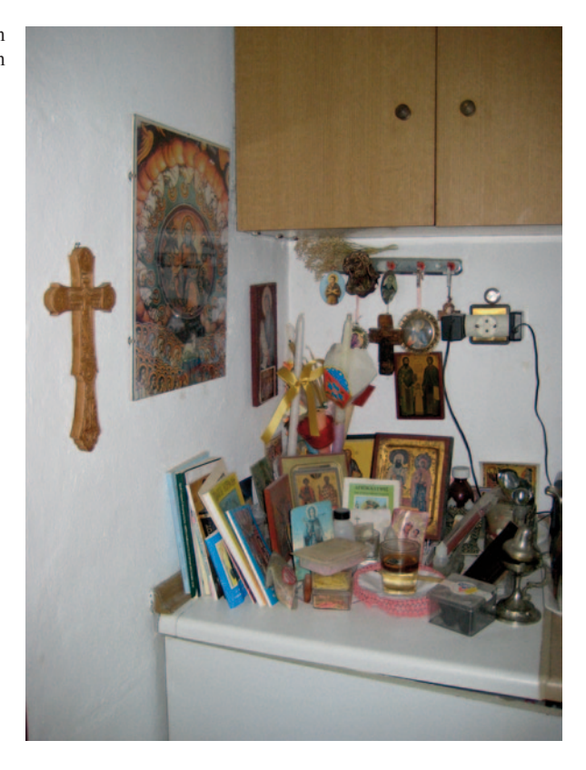
Fig. 2.1 'Religious corner' in an immigrant family home in Thessaloniki

The presence of religion in migrants' lives is sometimes reflected in their household decoration, with icons, crosses and pictures of saints (Fig. 2.1). Rather different from the situation of Albanian migrants in Greece, parents in Florence are relaxed towards the religiosity of their children. Indeed, many of the adults admit to being non-religious and uninterested in religion.