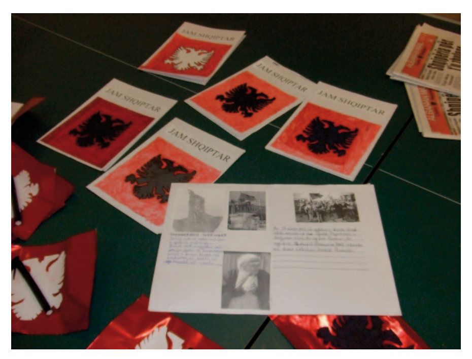
Fig. 2.3 Albanian flags and Albanian symbols painted and prepared by second-generation children in London in the Shpresa Organisation national celebrations, November 2007

Following Werbner (2010), bodily expressions and ordinary customs are seen as indicators of ethnicity; although they also express deeper, underlying understandings and experiences of individuality and autonomy versus the discipline and hierarchy advocated by parents. Nonetheless, a social orientation and tendency towards sharing as opposed to individual behaviour among teenagers is an expression of Albanianness.