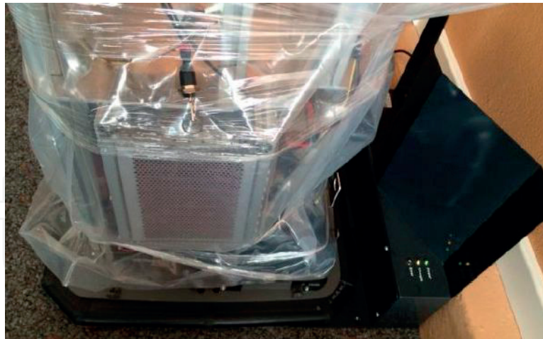
Figure 4. Docking station (black) and the robot wrapped in plastic for temperature tests.