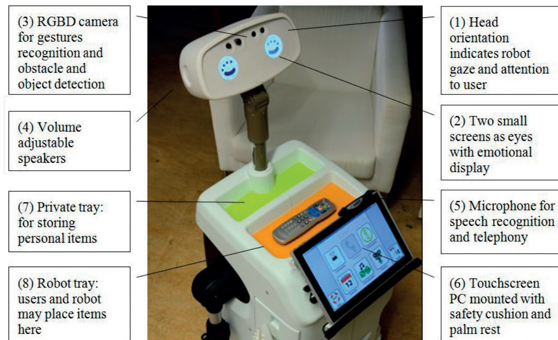
Figure 7. The upper body and the head of Hobbit. Also, depicted are the main components and functionalities.

As the last section of future improvements, we investigate more detail how the active head of the Hobbit robot worked and what could be improved. The active head in itself actually