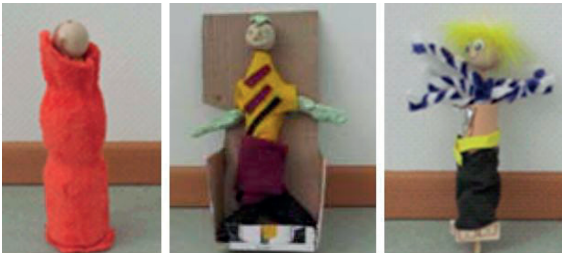
Figure 6. Three of the proposals for the robot design from workshop participants using simple materials to build up a robot model. Note the common characteristics of soft materials, a slim body and two arms (the model of the left robot does not have arms but the description of the user).

An issue regarding a safe robot motion is the mounting of the robot arm on the platform. Ideally, the entire arm should be within the limit of the footprint of the robot base platform. This is a challenge for the technical components: mobile arms of small size and reasonable payload do not yet exist. It also needs to be taken into account that during arm motion planning the arm motion will come out of the base footprint and hull. But it needs to be considered for avoiding self-collisions and collisions with the environment. Moving the arm and specifically the shoulder in a few centimetres is actually possible and is feasible in a final robot system concept.