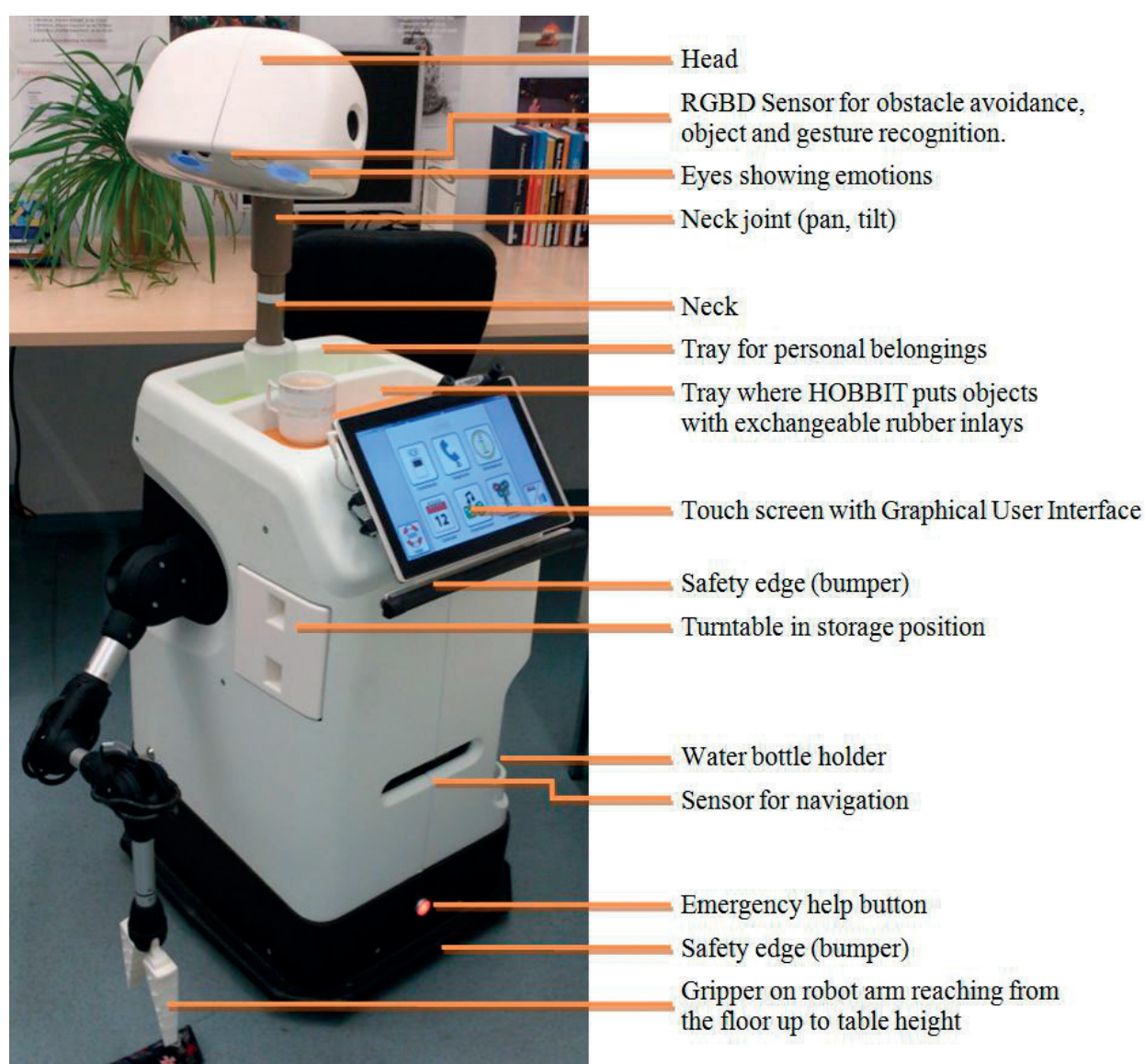
Figure 1. The service robot Hobbit designed to help older adults stay longer independent at home. Its primary functionality is coping with emergency situations, grasping objects from the floor or transporting objects to avoid falls and is a good collection of entertainment and physical and cognitive fitness functions.

The rationale behind this selection of feeling safe at home is that when an older adult falls it is necessary to transfer to a care facility. Since this is the primary cause for these transitions, any measure to increase the perceived safety at home will aid to improve the situation for the users. Consequently, we introduce a mobile robotic solution that sets out to discover falls. It does so in a proactive way to avoid falls in the first place. The concept has been developed together with professional care personnel. The result is the robot Hobbit. It provides a set of