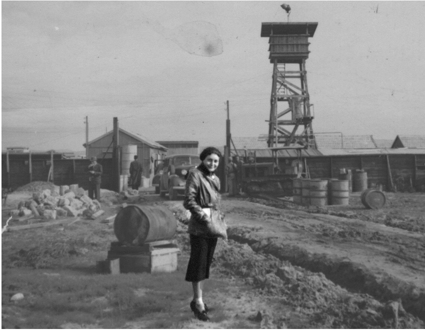
Visiting a new settlement, 1938