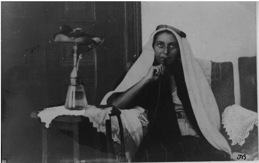
At the wedding of Trans Jordanian Prince Talal, 1934