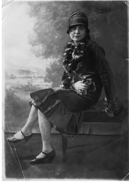
At a photographer's studio, 1932