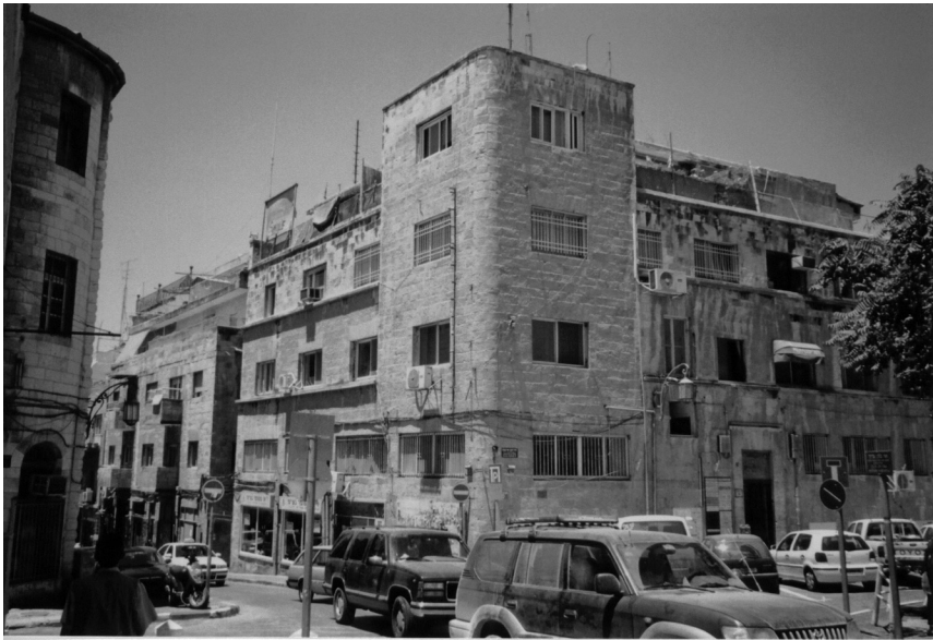
Building of The Palestine Post