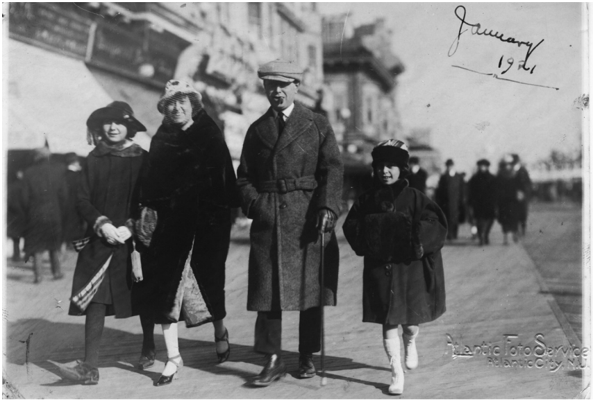
On Atlantic City boardwalk with parents and sister, 1921