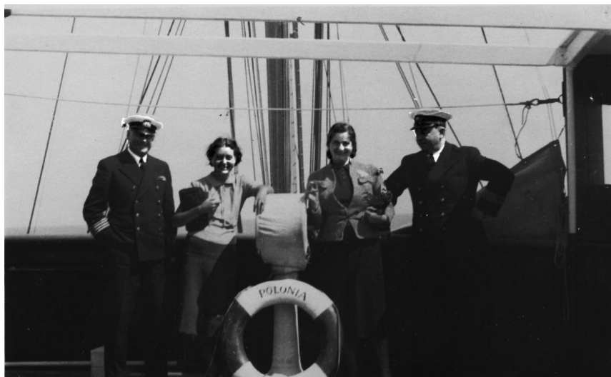
On the ship Polonia on the way to Poland, 1937