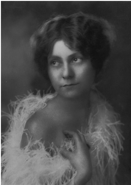
In Atlantic City, 1931