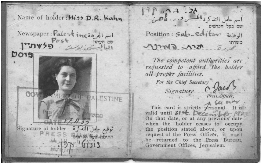
Journalist's ID card from The Palestine Post , 1933