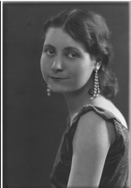
In Atlantic City, 1932