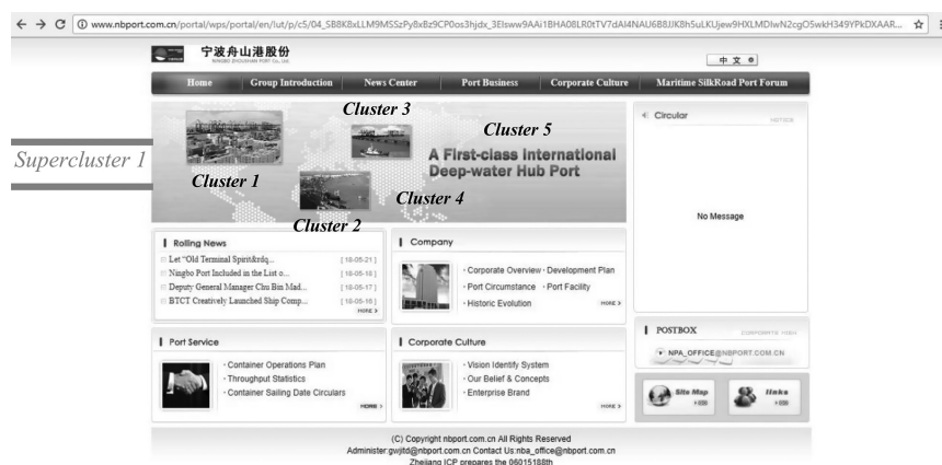
FIGURE 2.1 Supercluster 1 in the home page of NZP

The visual structure of representation is classificatory with some framing in it. Each cluster element of the composition is framed in three distinctive images by