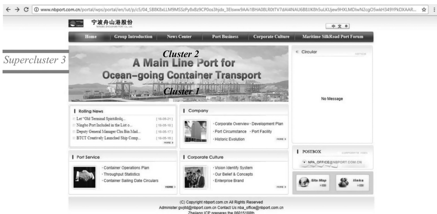
FIGURE 2.3 Supercluster 3 in the home page of NZP

When we move to the last rolling page in Supercluster 3 shown in Figure 2.3, it involves mainly two clusters, with one specifically for visual and the other linguistic. Cluster 1 shows the image of what is considered as the first-class container berth at