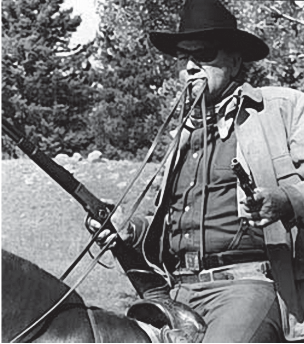
John Wayne in TRUE GRIT

and protocol that remains exemplary in the genre. Hathaway was always a redoubtable pictorialist, serving up unostentatious, deeply gratifying compositions in which action and place are framed to mutual enhancement. He had the eye of a children's storyteller, neither romantic à la John Ford nor expressionistic à la Anthony Mann. Abetted by veteran cinematographer Lucien Ballard (whose foursquare, primary Technicolor images are as satisfying as, if radically distinct from, his dynamic work for Peckinpah that same year), he creates a heart-stirring canvas of the West, from the homely town of Fort Smith – with train station, courthouse, and the gallows in the town square in civilising contiguity – to the trembling aspen forests, picturesque arroyos, and long, deep mountain meadows of the Indian Nation through which the quest of Marshal Rooster Cogburn (Wayne) leads.