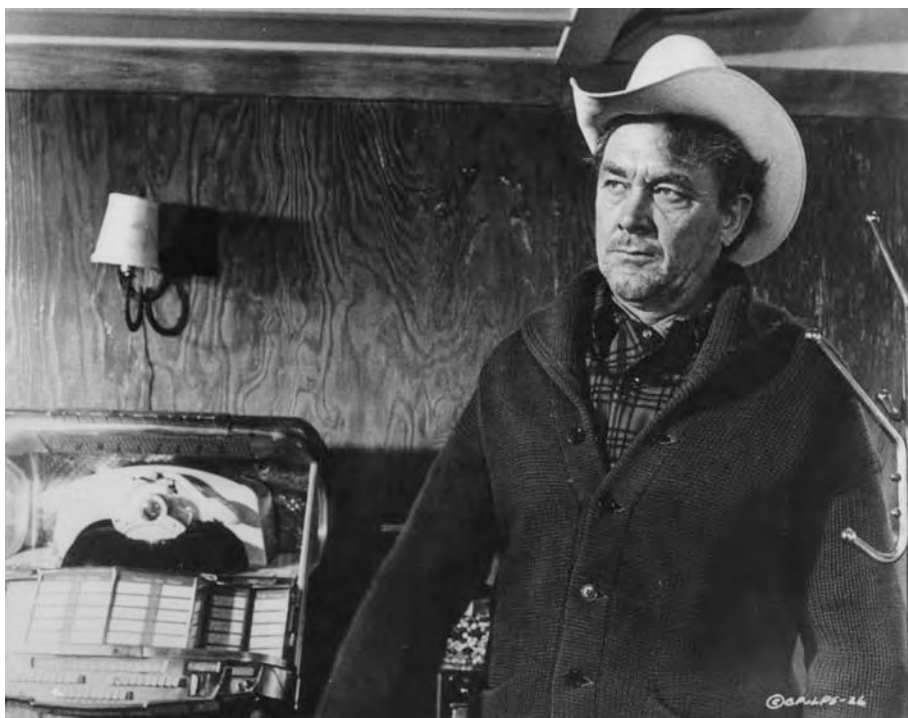
Ben Johnson in THE LAST PICTURE SHOW

tions. Often connected to a niche consciousness, the standard-bearers of independent cinema consequently helped to establish a niche market, which could then easily be appropriated or inhaled by the mainstream industry. The important "Indie" companies of the Eighties and Nineties are today part of or closely associated with major studios. In addition, the studios themselves have set up their own labels to cater to the (formerly) "independent" market. In Late Capitalism, the so-called alternatives almost always turn out to be mere variations of one and the same economic logic.