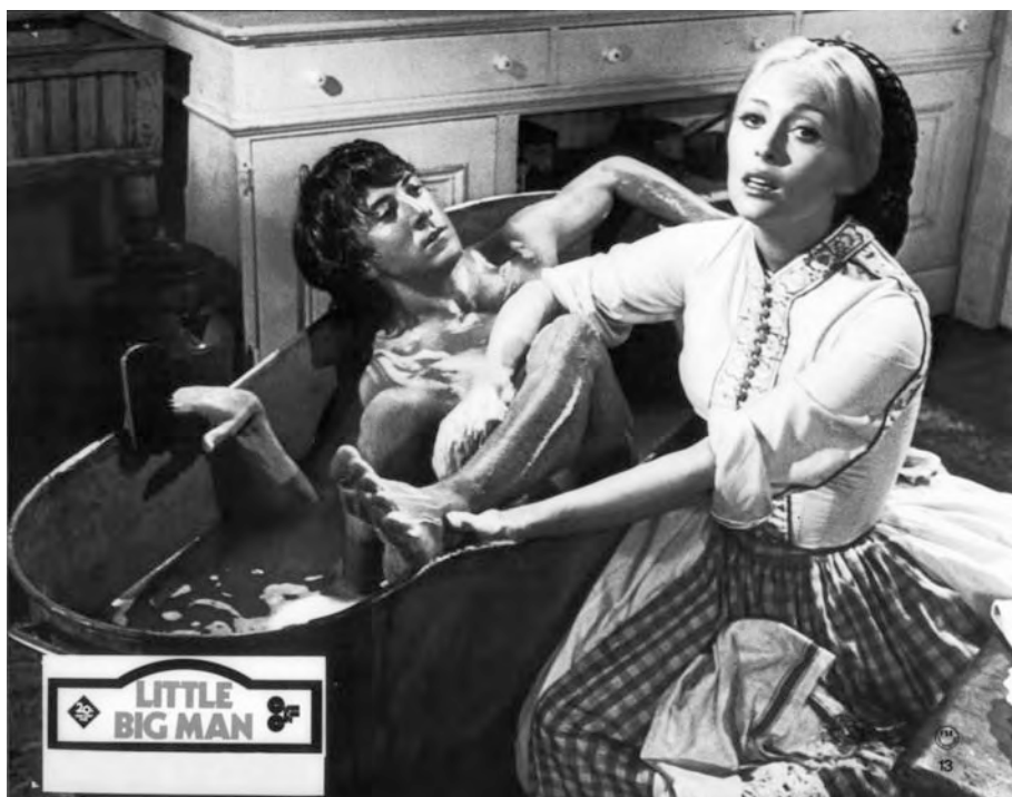
Dustin Hoffman and Faye Dunaway in LITTLE BIG MAN

(from BONNIE AND CLYDE to TAXI DRIVER ); and economically, by entirely misunderstanding the willingness of a film industry – temporarily weakened by economic setbacks – to make concessions. There seemed to be no other way of resolving the dialectic between “autonomous” creativity and large investments (= expectations of profit) than by staging quasi-liberating catastrophes (from ZABRISKIE POINT to HEAVEN’S GATE ). In many films of the New Hollywood era, these conflicts create a magnificent richness and enormous internal tensions and an incoherence, which lays bare their conditions of production and, consequently, the contradictions in American culture. 10 As Robin Wood has observed: “The films seem to crack open before our eyes.” 11