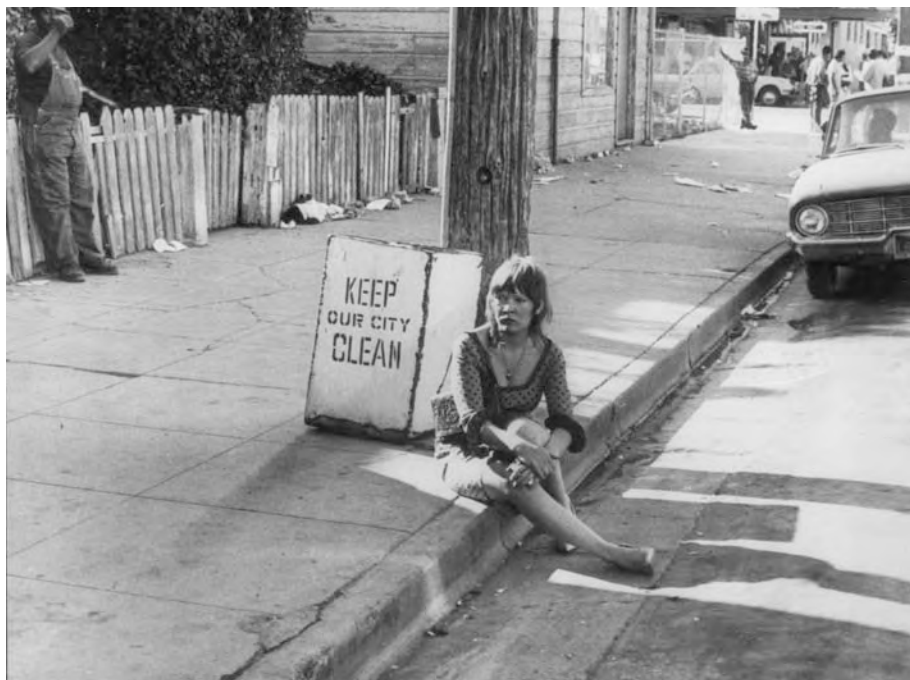
Candy Clark in FAT CITY

film after another, each more tedious than the one before, drowning in an excremental boredom that lent new meaning to the phrase “up shit creek”. But to see what was truly absent here, and what was really at stake, imagine an alternate movie universe where instead of G.I. BLUES, he had been cast opposite Sinatra in THE MANCHURIAN CANDIDATE. Here is a film that captured the secret, encrypted side of Presleyan myth: the shell-shocked, brainwashed soldier-assassin as a version of the post-Army Elvis, even as the belief that rock’n’roll was a communist plot would fit snugly into the movie’s conspiratorial milieu. And surely Angela Lansbury’s ruthless character suggests a deliciously malign composite of Presley’s manager Col Tom Parker and his adored mother Gladys – totalitarian love, a military-industrial Oedipus complex. Operating in the shadow of Sinatra, this Manchurian Elvis could have given us a taste of the real one’s tangled double-agency, at once pawn and King, culture hero and dupe, emblem of liberation and of the all-American craving to just follow orders. (Like an America getting ready to declare war on itself, there was no way to tell which side Elvis was really on.) From there it isn’t hard to see him restored to his feral, greasy Memphis self, riding off into A FISTFUL OF DOLLARS or playing the noble astronaut-savage in PLANET OF THE APES, finally apotheosising his career in the Seventies with the role of a washed-up lifetime – FAT CITY.