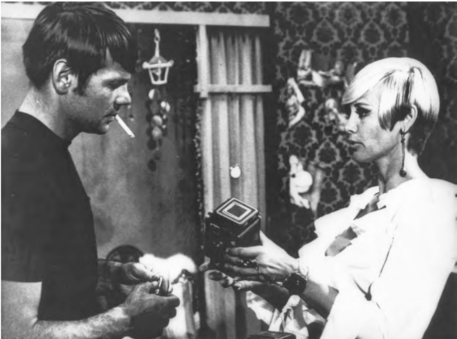
Gary Lockwood and Anouk Aimée in THE MODEL SHOP

Moreau but of the ruptures between Old and New Hollywood. (In this context, it is remarkable to see how many American films of this moment are about filmmaking: DAVID HOLZMAN'S DIARY, SYMBIOPSYCHOTAXIPLASM, TARGETS, COMING APART, MAIDSTONE, ICE, MEDIUM COOL, ALEX IN WONDERLAND, LION'S LOVE, THE LAST MOVIE. Whereas these largely modernist works are told 'in the present tense', mirroring the filmmaking questions and problems of their own era, the wave of films-about-cinema which followed a few years later returned to feelings of nostalgia with a vengeance. THE DAY OF THE LOCUST, THE GREAT WALDO PEPPER, THE LAST TYCOON, NICKELODEON, HEARTS OF THE WEST, GABLE AND LOMBARD, THE WILD PARTY and INSERTS seem to reflect a certain shift in American self-perceptions: The potentially anti-illusionist debate in which films-about-cinema always somehow engage is now being sealed off and displaced into a remote, mythical past: once upon a time, there was a cinema ...).