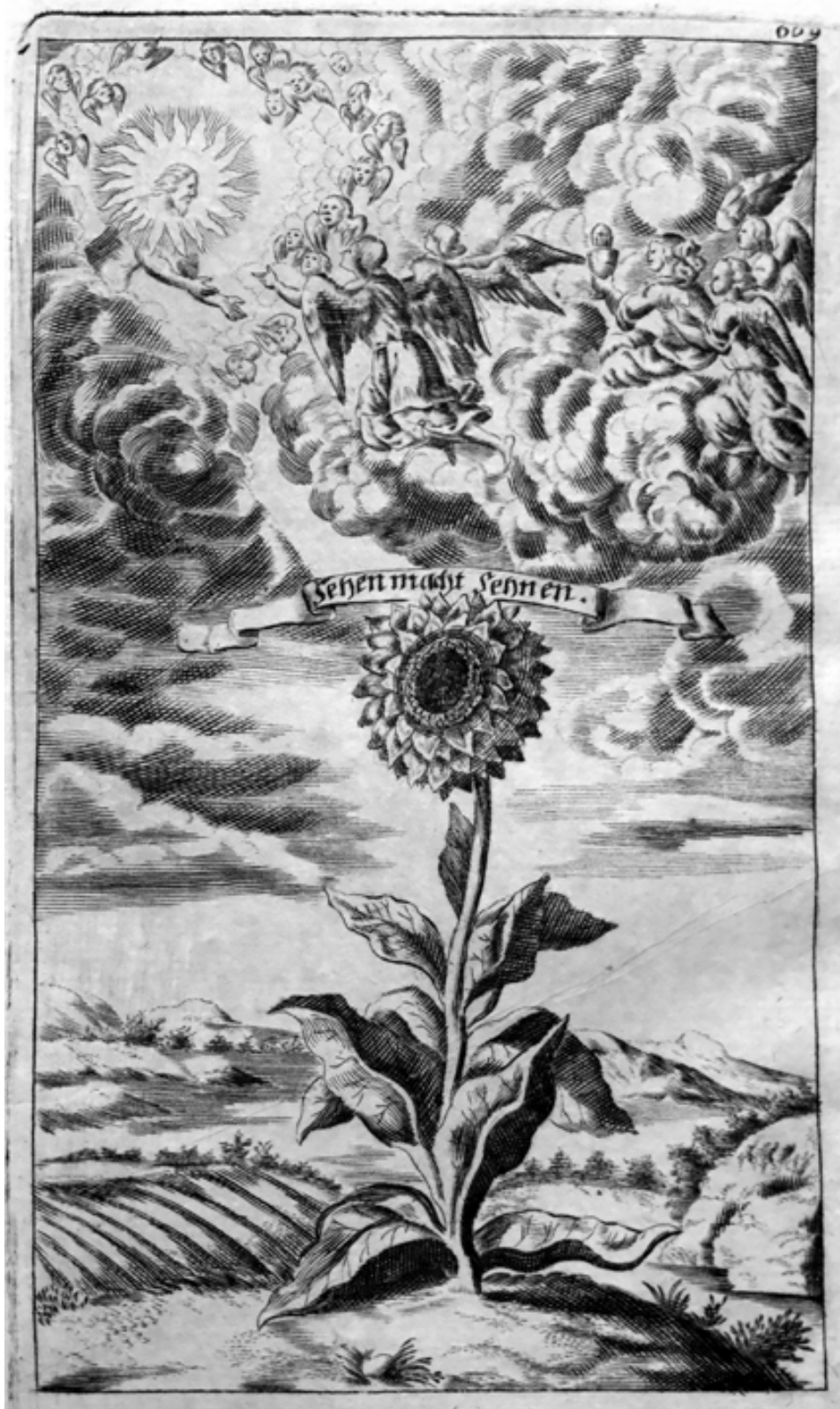
fig. 3: Catharina Regina von Greiffenberg, Der Allerheiligsten Menschwerdung/ Geburt und Jugend JEsu Christi/ Zwölf Andächtige Betrachtungen : [...], BSB München Rar. 4284 (Nürnberg: J. Hofmann 1678), beside p. 609.