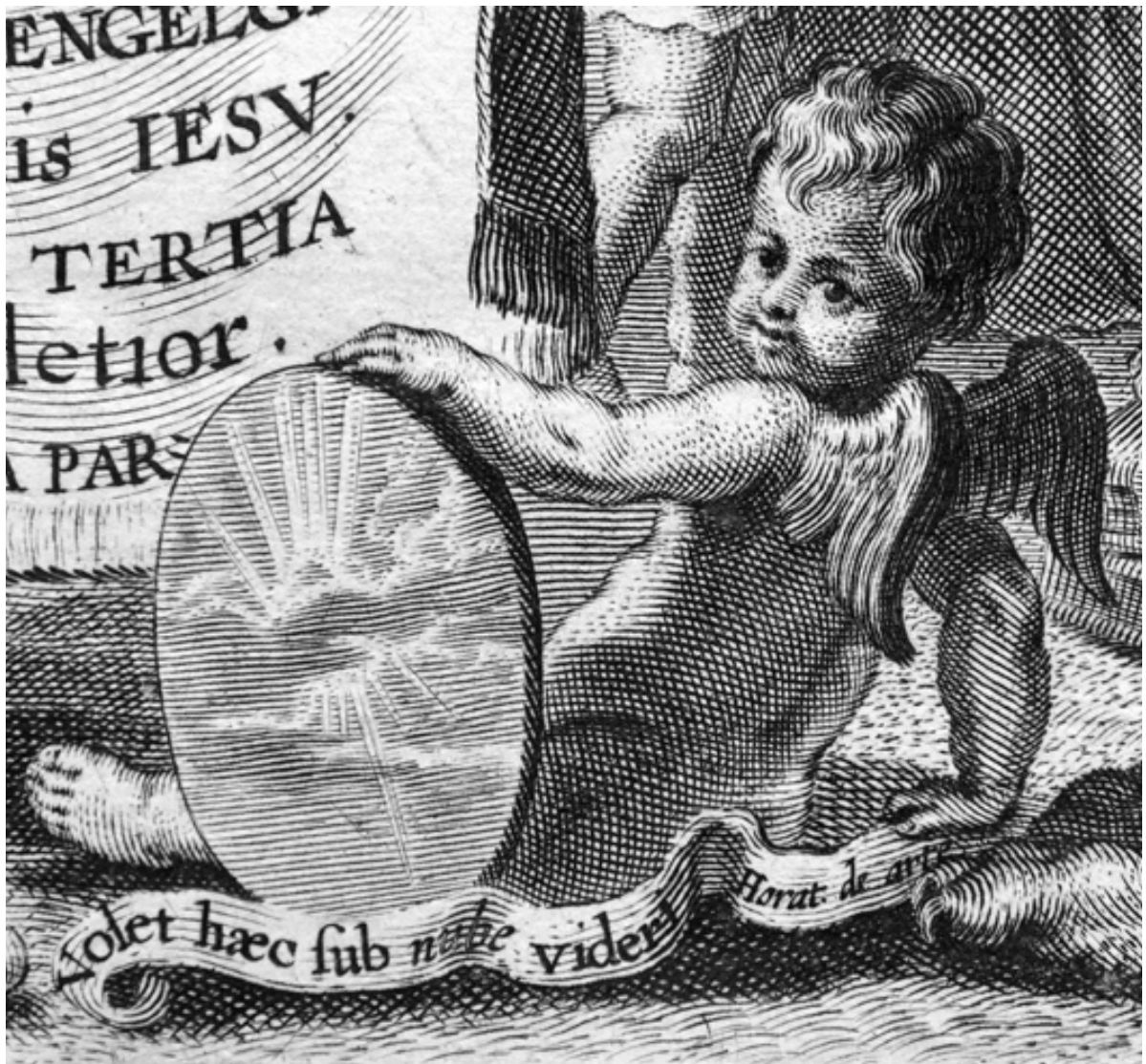
fig. 8: Idem, detail.

Thus, to be decoded are (1) the four emblem medallions in the title copperplate engraving of Engelgrave's Lux Evangelica , also with regard to the question of how their motifs, all taken from the ancient pagan tradition (Horace, Virgil, Ovid), are to be interpreted as a self-reflection of emblematic art; (2) the symbols of the evangelists; (3) the light-giving Holy Scripture presented by them; (4) the Holy Spirit who floats down from heaven in the form of a dove, which itself is to be deciphered, and