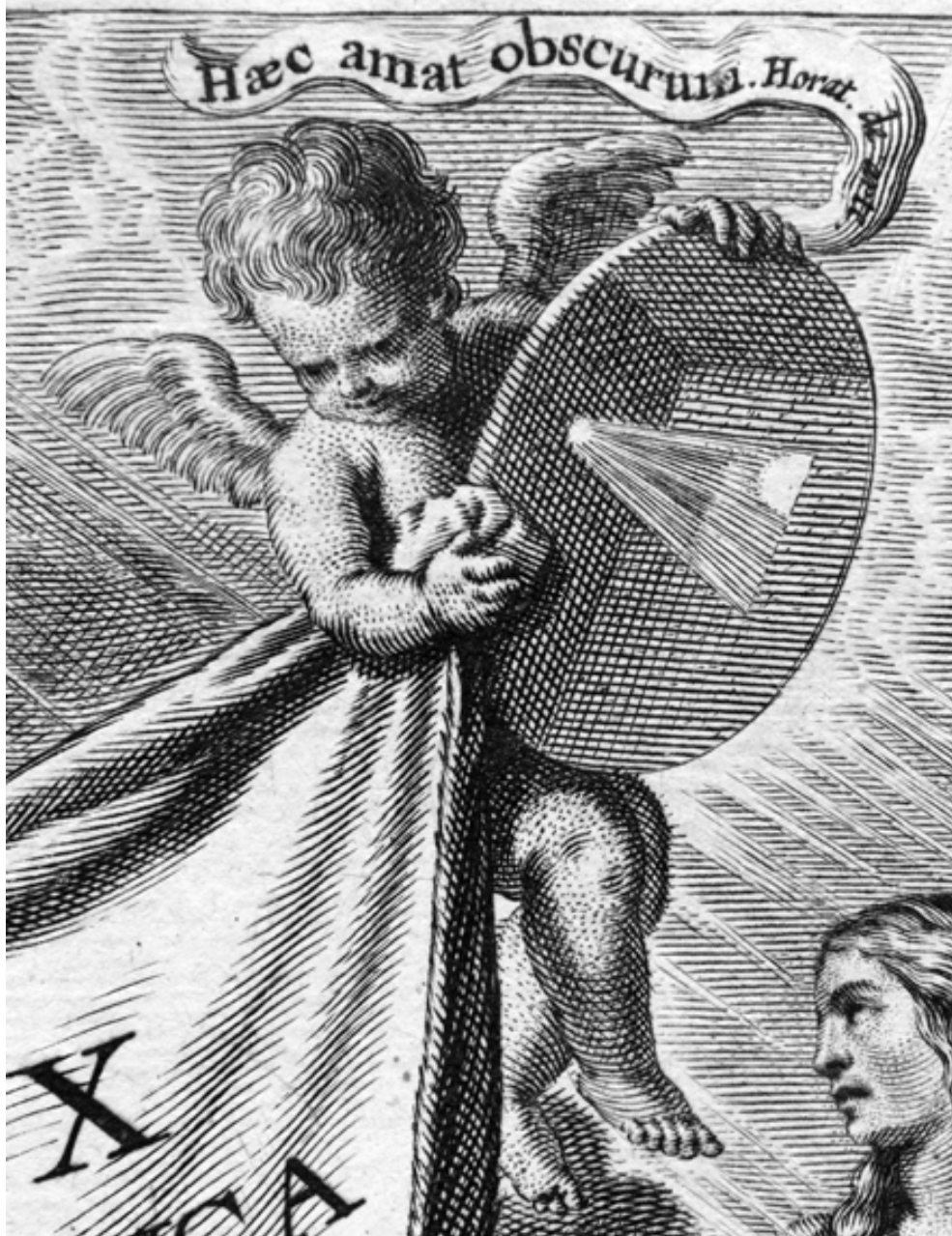
fig. 7: Idem, detail.

on it from behind (fig. 9). The motto (“Cervice refulsit” [“it shone on her neck”]) comes from Vergil (70–19 BCE), Aeneis 1.402 – a passage without the knowledge of which interpreting the emblem can hardly succeed. It tells the story of Aeneas, who meets his mother, the goddess of love, Venus, for the first time – hidden in the