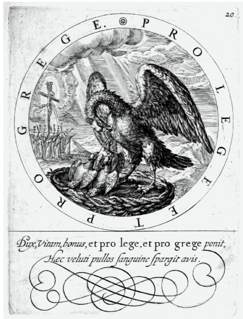
fig. 2: Gabriel Rollenhagen, Selectorum Emblematum CENTURIA SECUNDA , SUB Göttingen ALT 77 A 17691 RARA (Utrecht, Arnheim: J. Janssonius, 1613), Nr. 20.

Another relevant example in this regard is in the work of Catharina Regina von Greiffenberg (1633–1694): 20 The emblem etching (fig. 3) visualizes the sunflower aligned with Christ as the Sun of Righteousness (Mal 3:20). The Son of God, whose head is surrounded by the sun, is set in the upper left of the image – in a heavenly scene in which he receives a be-