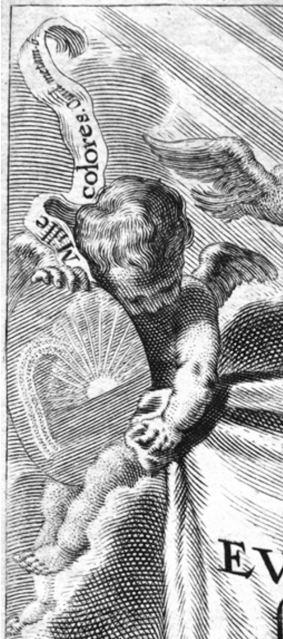
fig. 6: Idem, detail.

The motto “Haec amat obscurum” (“it loves the dark”) comes from Horace’s De arte poetica v. 363 (65–68 BCE). The quotation is found in