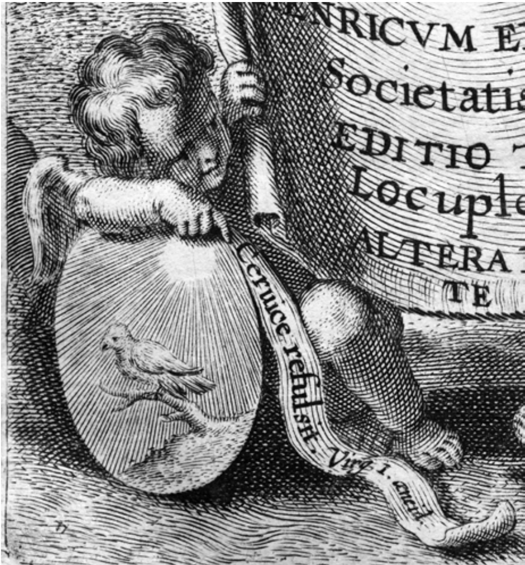
fig. 9: Idem, detail.

gelical light ( lux evangelica ) hidden under the curtain of sacred symbols is “varie” (varied) “adumbrata,” i. e., not fully brought to light, but rather shaded or sketched. In this, an eschatological reflection comes to bear regarding the limits of performance and the provisionality with which biblical exegesis must come to terms until the Judgment Day.