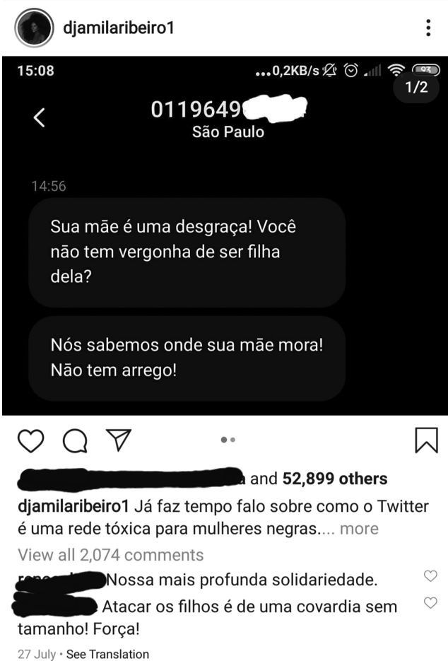
Figure 3.1 Sample of hateful material received online by Djamila Ribeiro.

against intellectuals. There is a clear anti-intellectualism. So there is this political side of it, attacks against left-wing politicians. Manuela D'Ávila, 7 for example, has been victim of several attacks . . . These spaces are not detached, since these are structural discriminations; therefore, they structure all social relations. Social media platforms are also spaces where hate speech is spread against historically discriminated groups.