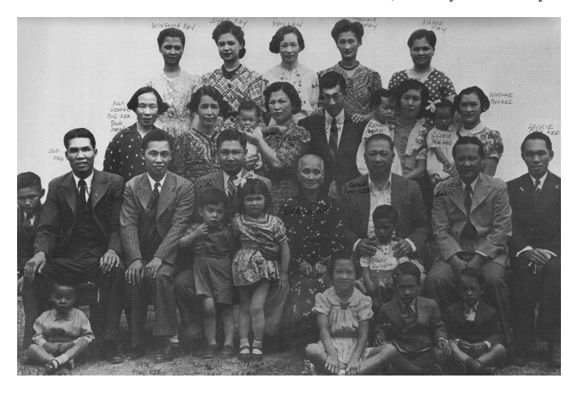
Figure 3.5 The extended Fay family, c. 1940. Much like the family portrait of Marina's immediate family (Figure 3.4), this image of the extended Fay family depicts at least four generations. The number of female members in the extended family is striking in this image and provides further visual evidence of the long and enduring presence in Australia of women in the Fay family.